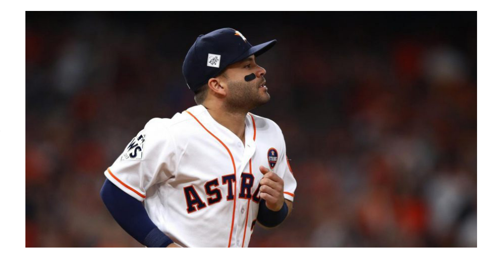
{\it The Houston Astros were \ caught for \ stealing \ opponents \ signals \ during \ games.}

At home, Jose Altuve had a batting average of .472 while putting together an insane 1.541 OPS (on base+slugging percentage) but on the road, where the Astros could not implement their cheating system, Altuve only batted .143 and had an OPS of .497.