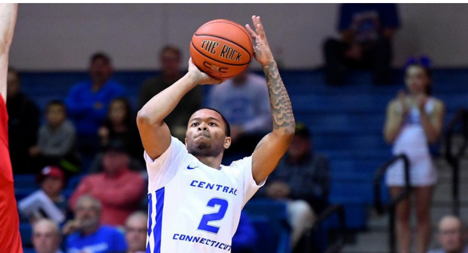
break up 33-22. CCSU Mens Basketball is back at home for two games this The Blue Devils kept the ball moving week against the Pioneers and Seahawks.