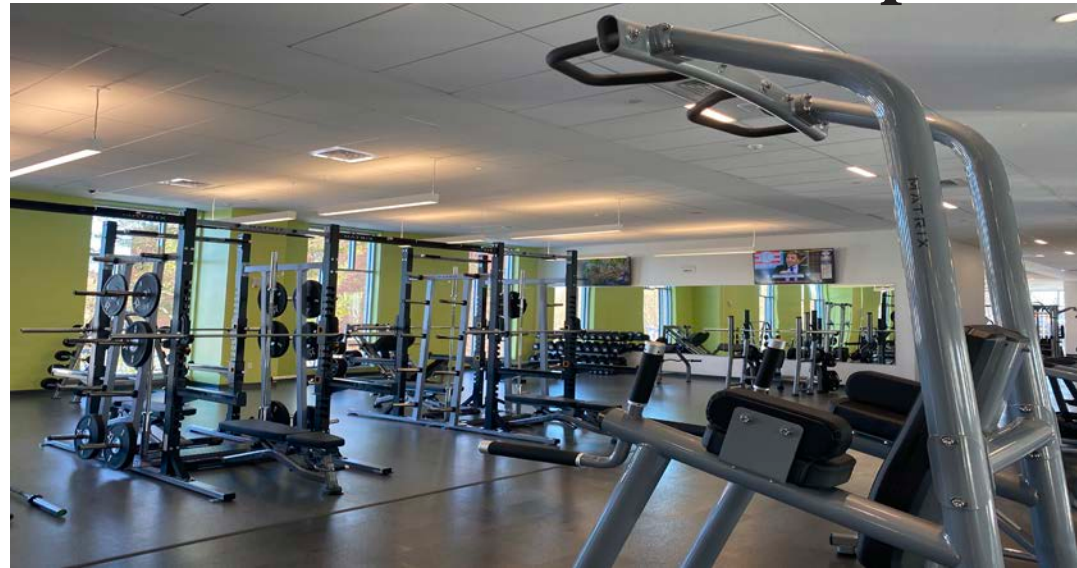
The Huang Family Recreation Center will be available to all faculty, staff and students on campus.

Huang Family Recreation Center Opens To Central Campus