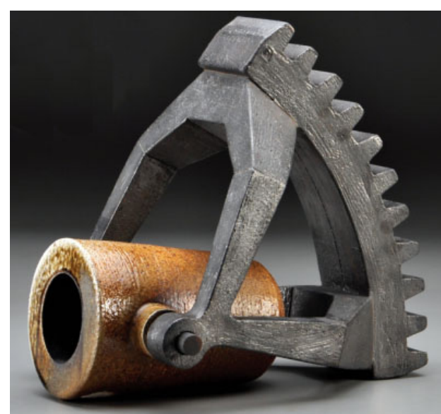
"Industrially Inspired" will open on Thursday, Jan. 30.