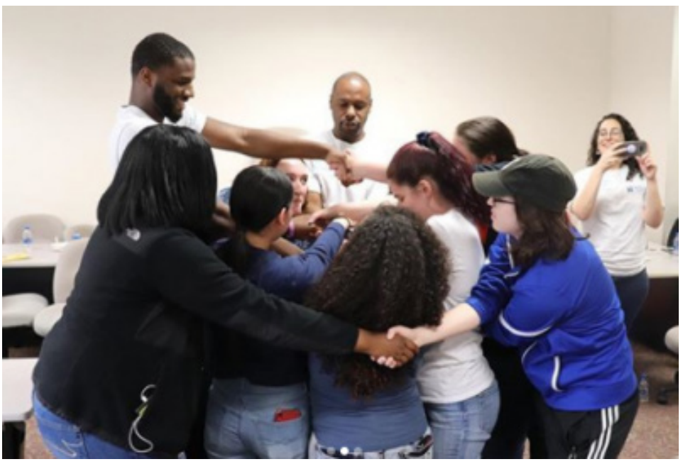
Mentees and mentors play teamwork themed games together.

Although the focus of the program is helping freshmen and sophomores become acclimated to college, Success Central is beneficial to