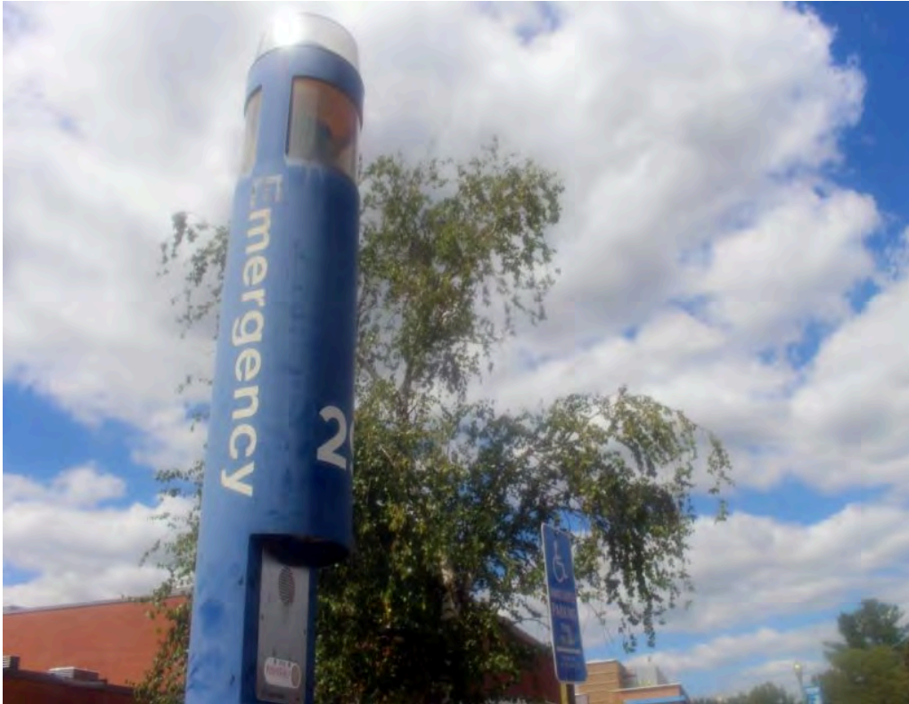
The CCSU Police Department is increasing campus patrol after a potential shooting.