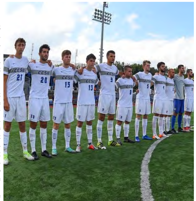
CCSU Men's soccer is looking to bounce back after a one-win 2018-2019 season.