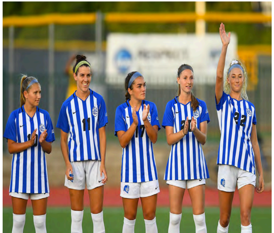
CCSU Women's soccer now sits at 1-1 on the season. CCSU ATHLETICS