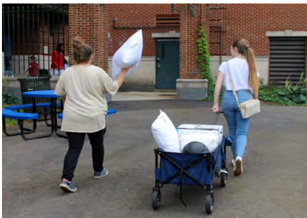
CCSU residents made the move into their dorms.

Central Connecticut students started college life off with a bang even before the school year began with Monday's Resident Move-In Day. From food trucks to music, students beat the heat while hauling luggage with loads of fun.