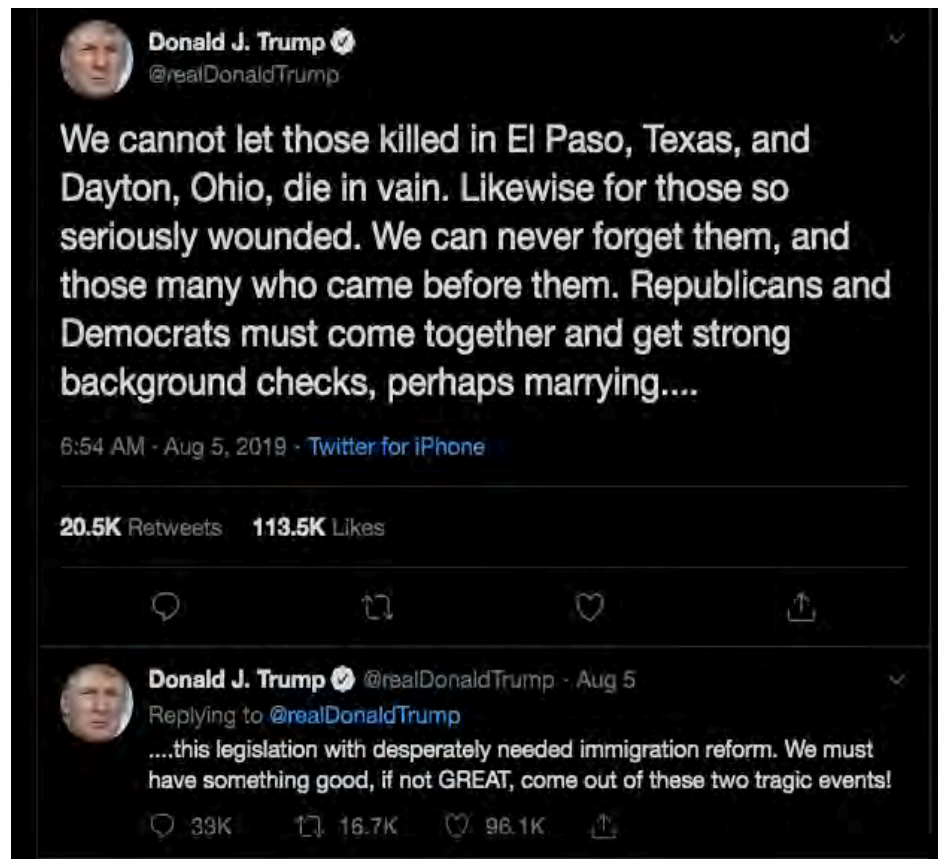
Donald Trump's tweets made headlines following the El Paso and Dayton shootings.

Trump is also directing the Department of Justice to "propose legislation ensuring that those who commit hate crimes and mass murders