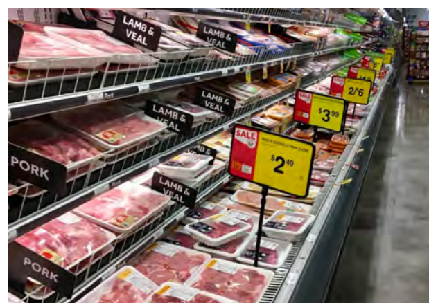
Animal meat should be more expensive than its plant-based alternative.