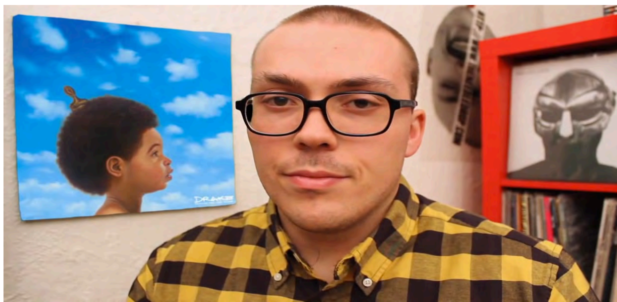
"The internet's busiest music nerd," Anthony Fantano.