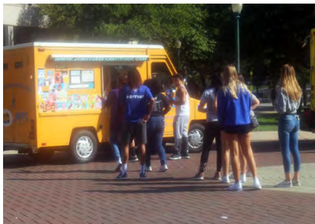
Several food trucks offered treats in the Student Center Circle.