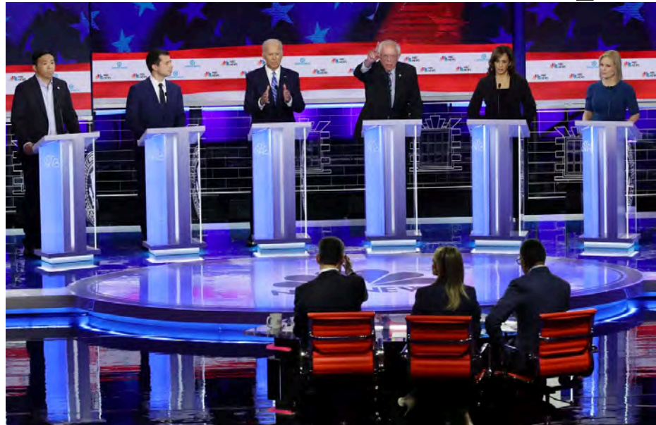
The Democratic debate has done more harm than good in trying to dethrone President Trump.

Harris was also called out for her "tough-on-crime" methods as a prosecutor, district attorney and state attorney general in the past, thus making her "For the People" campaign appear unreliable.