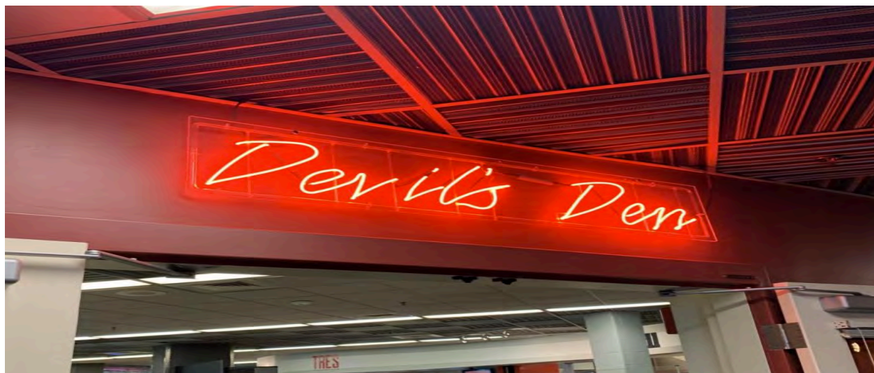
Devils Den @ 10 is a great place to meet other students.

Central may have more than 100 clubs, but we always have room for more. If you had a club in high school that you thoroughly enjoyed but don't see on our