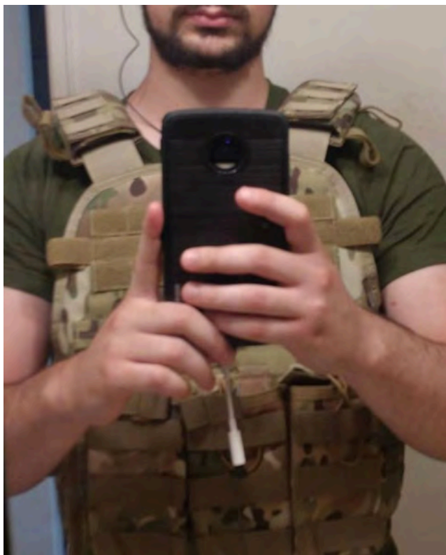
After a potential shooting at CCSU was stopped, campus safety is in the spotlight.