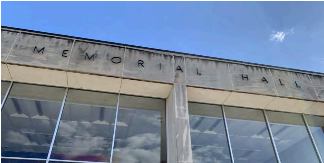
One of Central's dining halls, Memorial Hall.