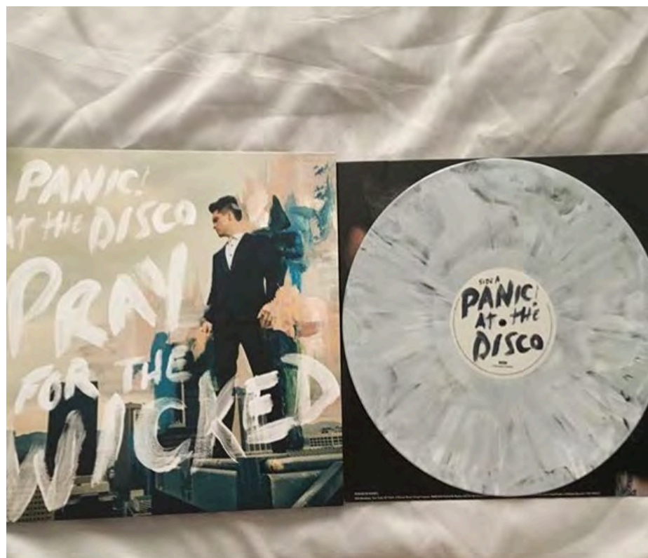
Panic! At The Disco’s six studio album “Pray For The Wicked” turned one year old on June 22.

“The Overpass:” This is my least played song of the whole album. However, I’m not sure why. It’s not a bad song by any means. I like that there are background singers, it gives me Broadway vibes. I also always envision a car speeding down a roadway as the song kicks in. However, it’s never a first choice to play, and I’ll