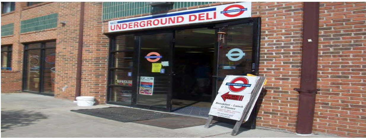
Local sandwich shop Underground Deli breaks down what minimum wage change means to them.