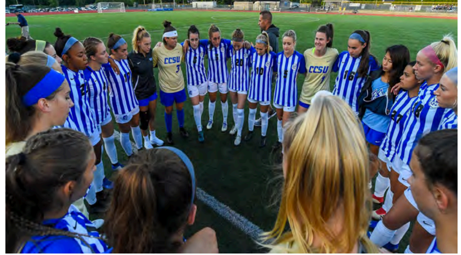
CCSU Women's soccer is looking to repeat as NEC champions.

With the former centerpieces of both the offense and defense absent from the team