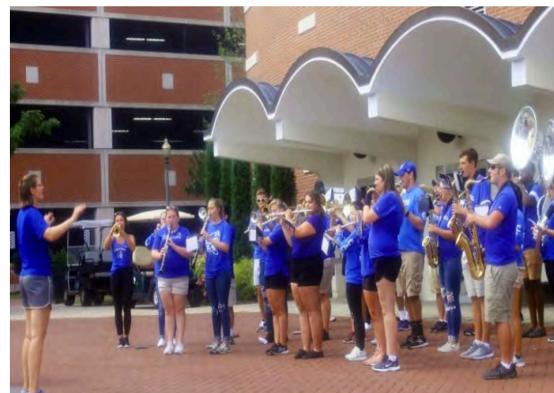
The CCSU Blue Devils Marching Band jazzed up Move-In Day with music.