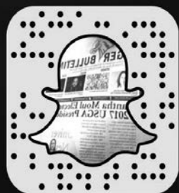
The Charger Bulletin chargerbulletin | 125

The barren setting and insanity-stricken characters are hopefully going to make the most shocking, exciting season yet. The first two episodes are available on demand and the third episode will air at 10 p.m. EST on Wednesday.