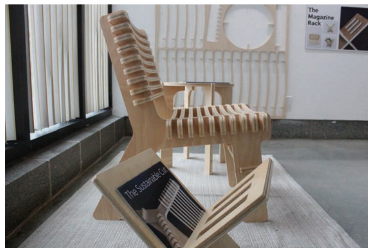
A view of Puff’s exhibit, West Haven, April 27, 2023.