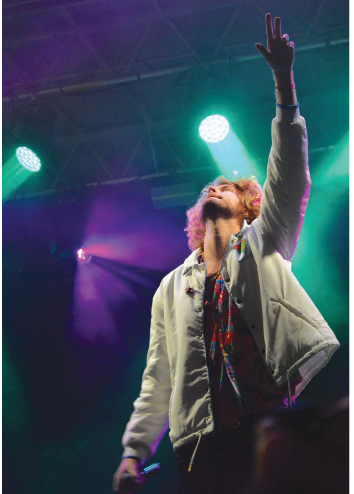
Yung Gravy points to the sky, West Haven, April 28, 2023.