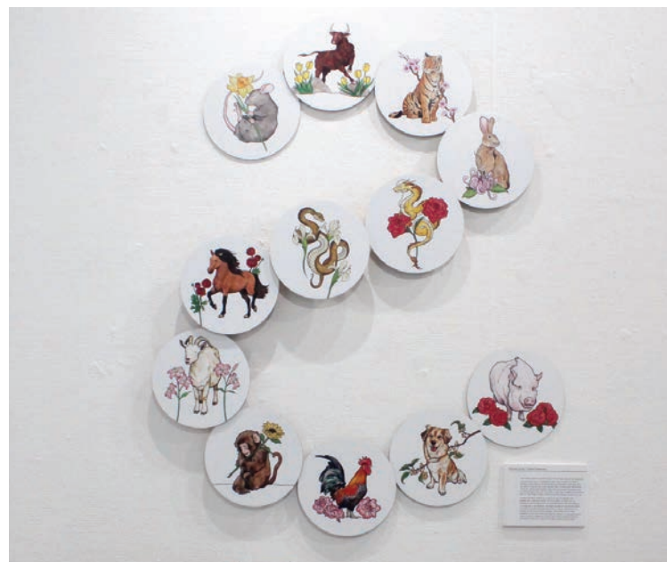
Licata’s display, West Haven, April 27, 2023.

These were not the only pieces on display at the gallery. If you want to see the other results of these students’ hard work, check out their art at the Seton Gallery until May 10.