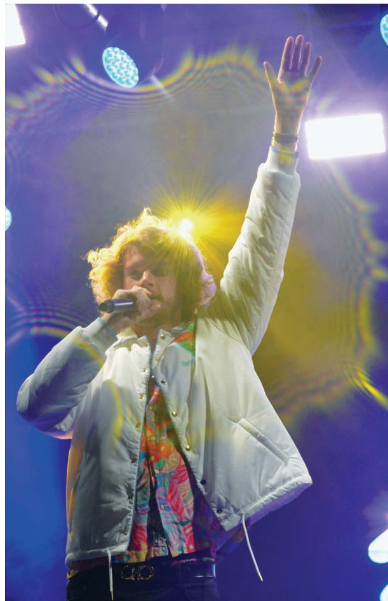
Yung Gravy onstage, West Haven, April 28, 2023.

Founder’s Day accomplished its mission of bringing people together on this university holiday.