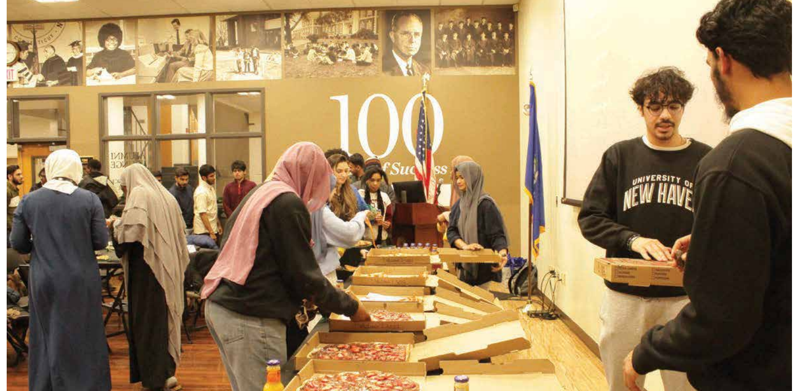
Attendees of the Ramadan banquet hosted by MSA in the Alumni Lounge, West Haven, March 22, 2024.

have been minor setbacks that could make the support of Muslim students more effective.