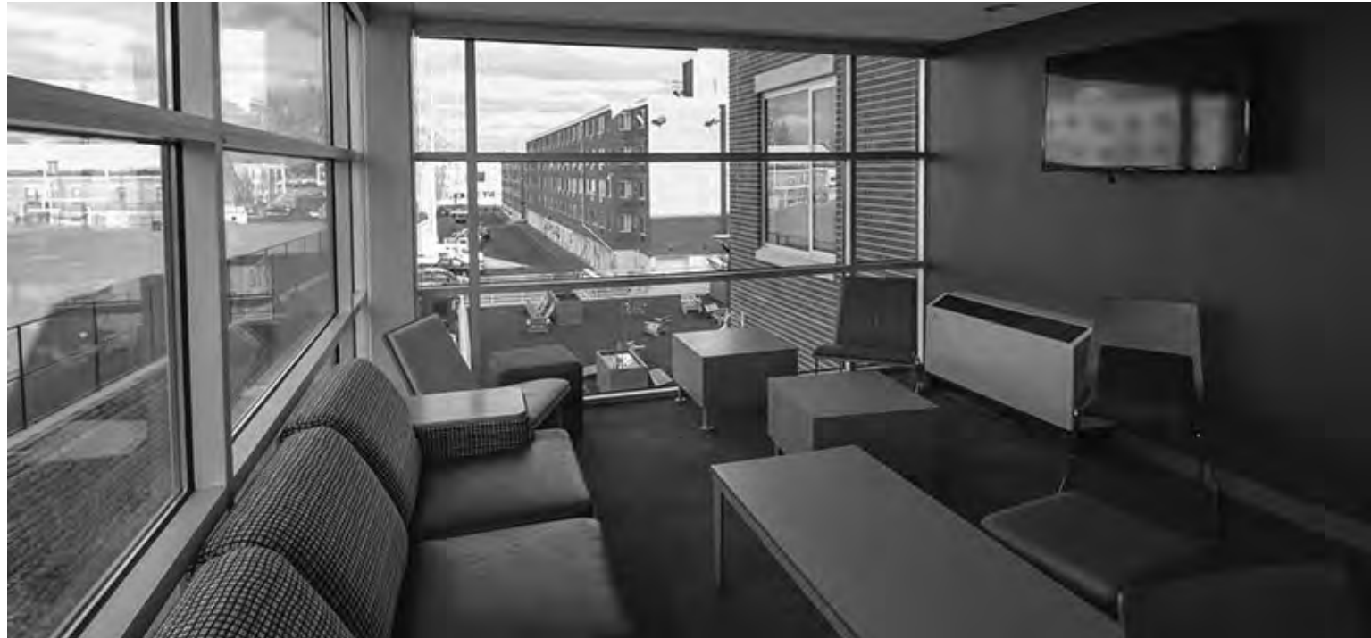
Westside Hall's main lounge (top) and common lounge overlooking Zolad Stadium (bottom), West Haven, March 24, 2024.

vent every week. We thought it was normal for college. I have had a lingering cough since October, I can't believe this."