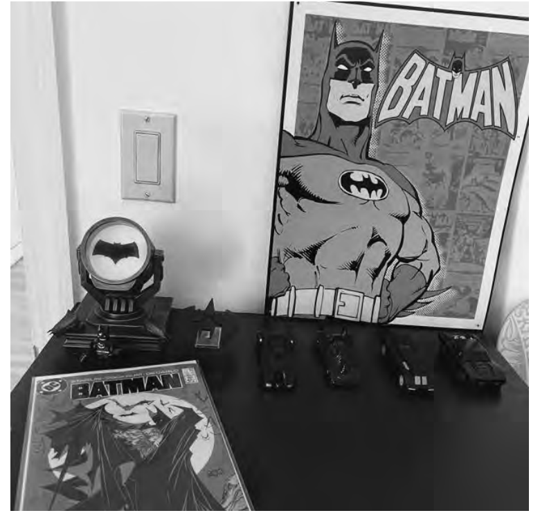
Collection of Batman memorabilia, West Haven, March 24, 2024.

Pick up one of those personal projects you've put aside for a while. Write that novel. Create that cake. And remind yourself that stress is temporary, as is this semester.