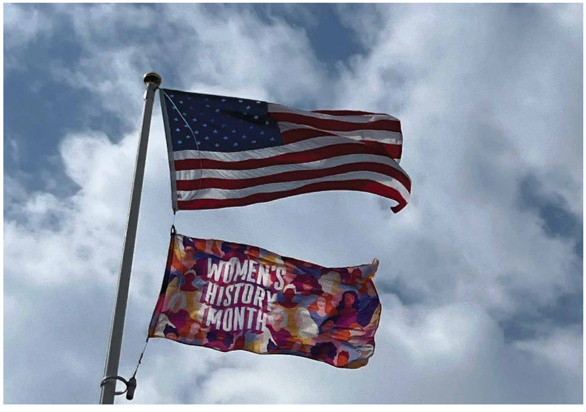
Women's History Month flag hanging above Kathy Zolad Stadium, West Haven, March 23, 2024.

Volume 105, Issue 19 | March 26, 2024 | West Haven, Connecticut