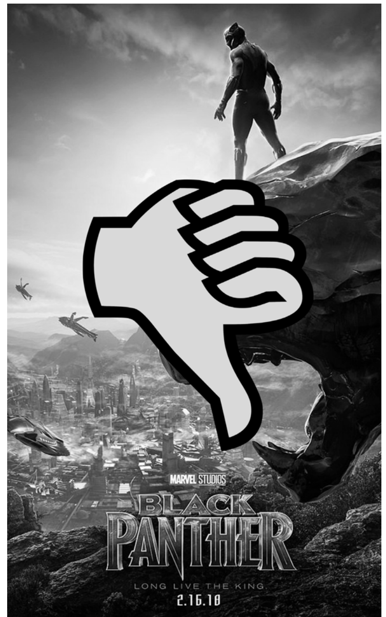
Graphic Illustration by Tyler C. Butler/The Charger Bulletin

Though I don’t believe “Black Panther” should be nominated for best picture, it is necessary in film history. “Black Panther” has opened the doors for superhero movies to be taken seriously as art, rather than just as movies to keep the family entertained. These unprecedented accomplishments show movie corporations that the public wants more films with minorities in leading roles achieving incredible feats.