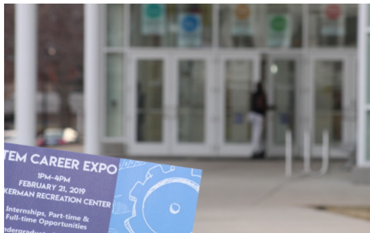
Above: The STEM Career Fair brought almost 70 employers to campus. Below: Students gathered to meet potential employers in the Beckerman Rec Center.