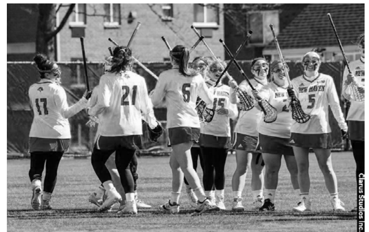
Women's lacrosse will look to continue their success, coming off of a winning season.

season will get underway Feb. 27 when they face Mercy College on the road. The Chargers will have their home opener on Mar. 12 when they take on crosstown rival Southern Connecticut State at Kathy Zolad Stadium. The rivalry will get underway at 4 p.m.