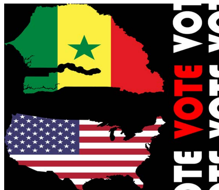
Graphic Illustration by Tyler C. Butler/The Charger Bulletin

In Senegal, voting is not usually easy and accessible unless you reside in a major city. For example, in semi-rural villages such as the one that my Senegalese family lives in, Touba Toul, it takes about an hour and 40 minutes by bus to make the trip to Theis, (people in villages generally do not own cars) which is the closest polling place. This is an hour and 40 minutes if the bus runs on time, if the bus runs at all, and if you make both your transfers. Usually, this is not a huge problem because in Senegal it is considered rude to arrive somewhere any earlier than an hour after the time that you were invited for. However, voting is not the same and requires a bit more