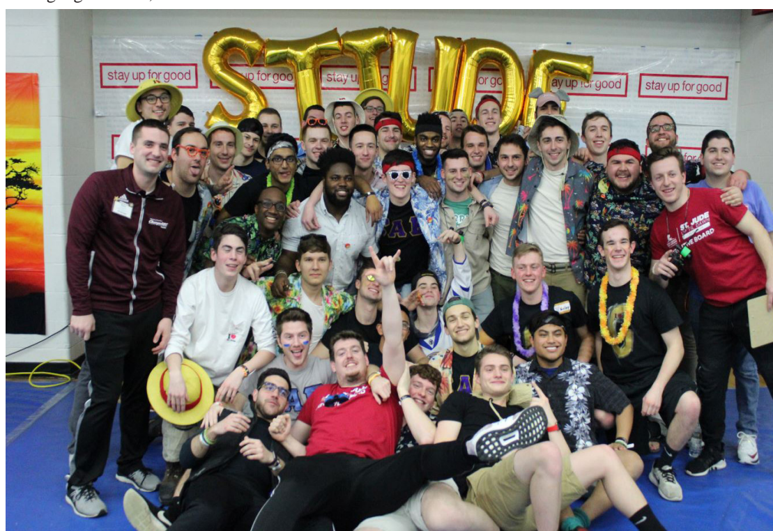
Sigma Alpha Epsilon had multiple teams that participated in Up 'til Dawn.