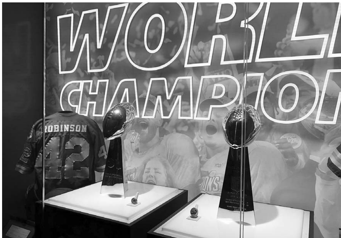
The Kansas City Chiefs’ two Super Bowl titles, Kansas City, Mo., Nov. 1, 2021.

There will be plenty to watch for in this game, and as we get closer to kickoff the anticipation is going to build up and set the stage for what should be a highly competitive game. Two of the league’s top teams will face off in just under two weeks in a game which could either end up a defensive battle or a shootout that comes down to the last possession.