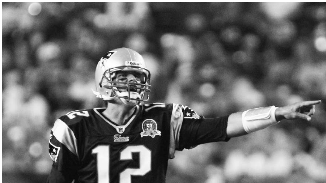
Tom Brady on the field against Washington, Washington D.C., Aug. 28, 2009.

Brady’s unprecedented career will surely earn him a spot in the Hall of Fame, leaving behind a legacy that changed the course of the NFL forever. His legacy on the field will never be forgotten, paving the way for future generations of quarterbacks.