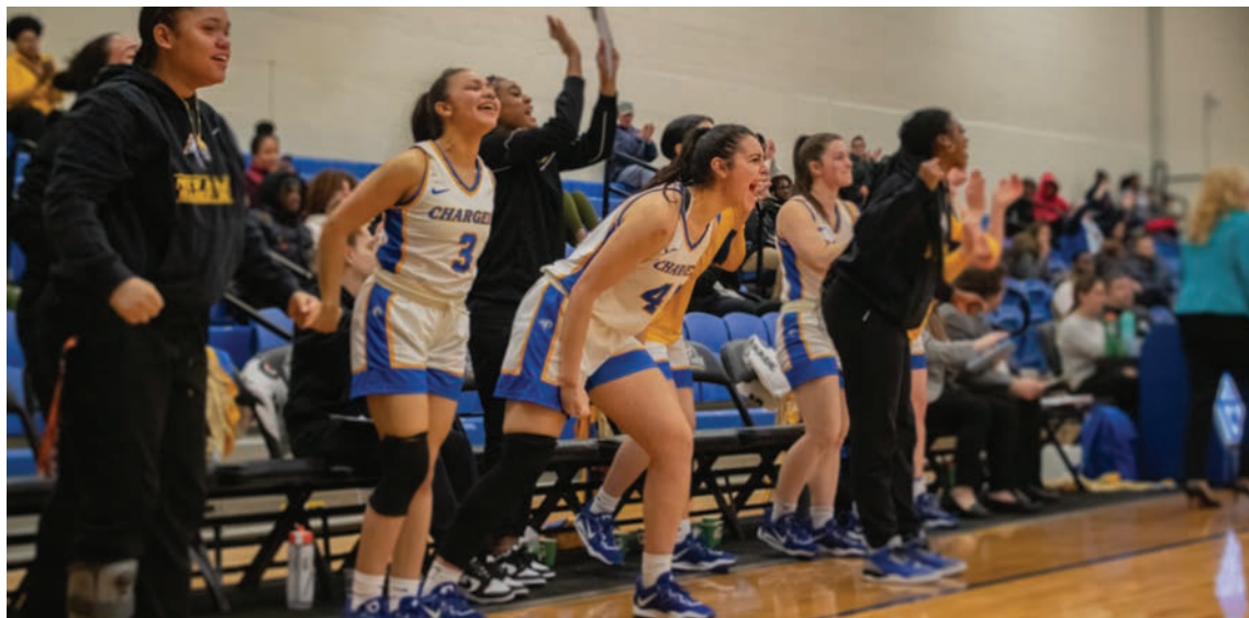
The New Haven bench celebrates against AIC, West Haven, Feb. 4, 2023.

Photo courtesy of Charger Bulletin/Tyler Rodriguez.