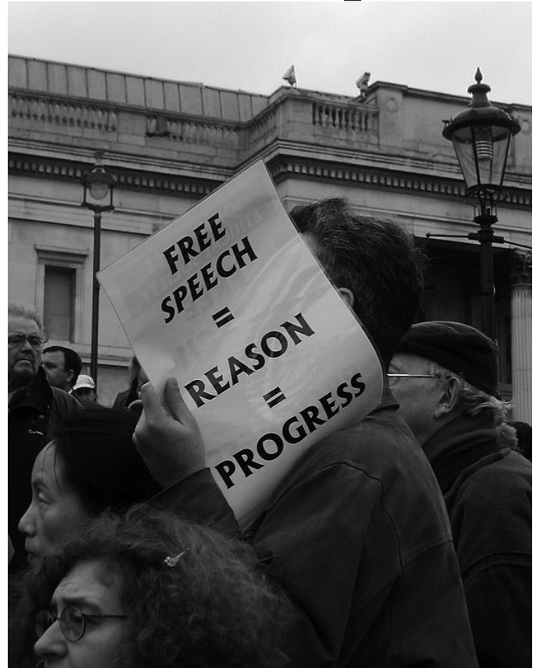
A person holds a free speech sign, London, March 25, 2005.

The Charger Bulletin will adhere to our beliefs and the belief that words and opinions have merit, regardless of whether you agree with them. We will not publish inherently harmful or violent ideas but we will provide a forum for members of society to have fruitful discussions. We abide by the First Amendment and will continue to do so as an Editorial Staff.