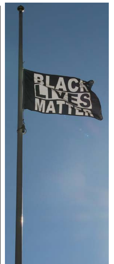
The BLM flag, West Haven, Feb. 1, 2023.