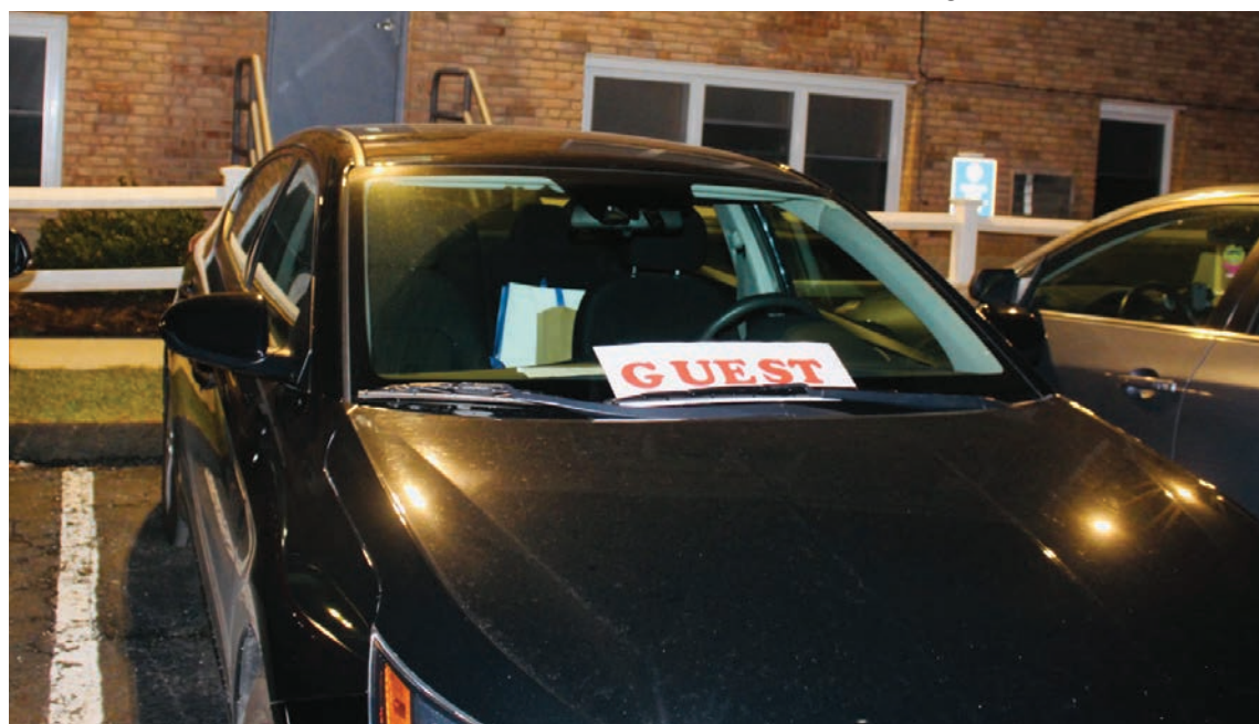
A car being labelled as a "guest" vehicle, West Haven, Feb. 3, 2023.

All information pertaining to the updated residential guest policy can be found on pages 175 and 176 of the student handbook. Infractions of the guest policy will be cause for a student conduct hearing.