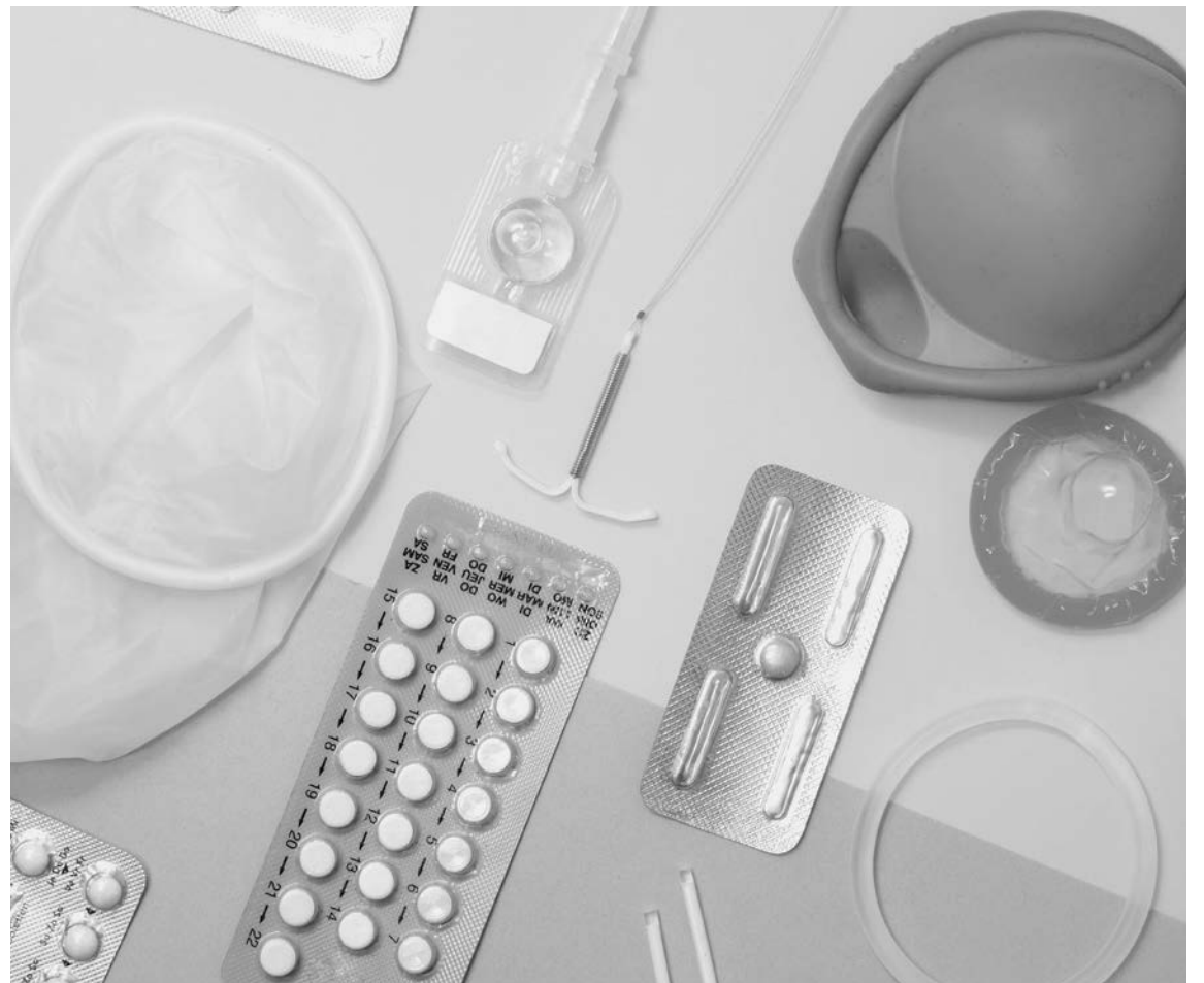
A table of various contraceptives.

This proposed rule would be one step forward in the fight for women to regain easier access to reproductive healthcare, after Trump and the Supreme Court made it increasingly harder for women to obtain certain rights regarding reproductive healthcare.