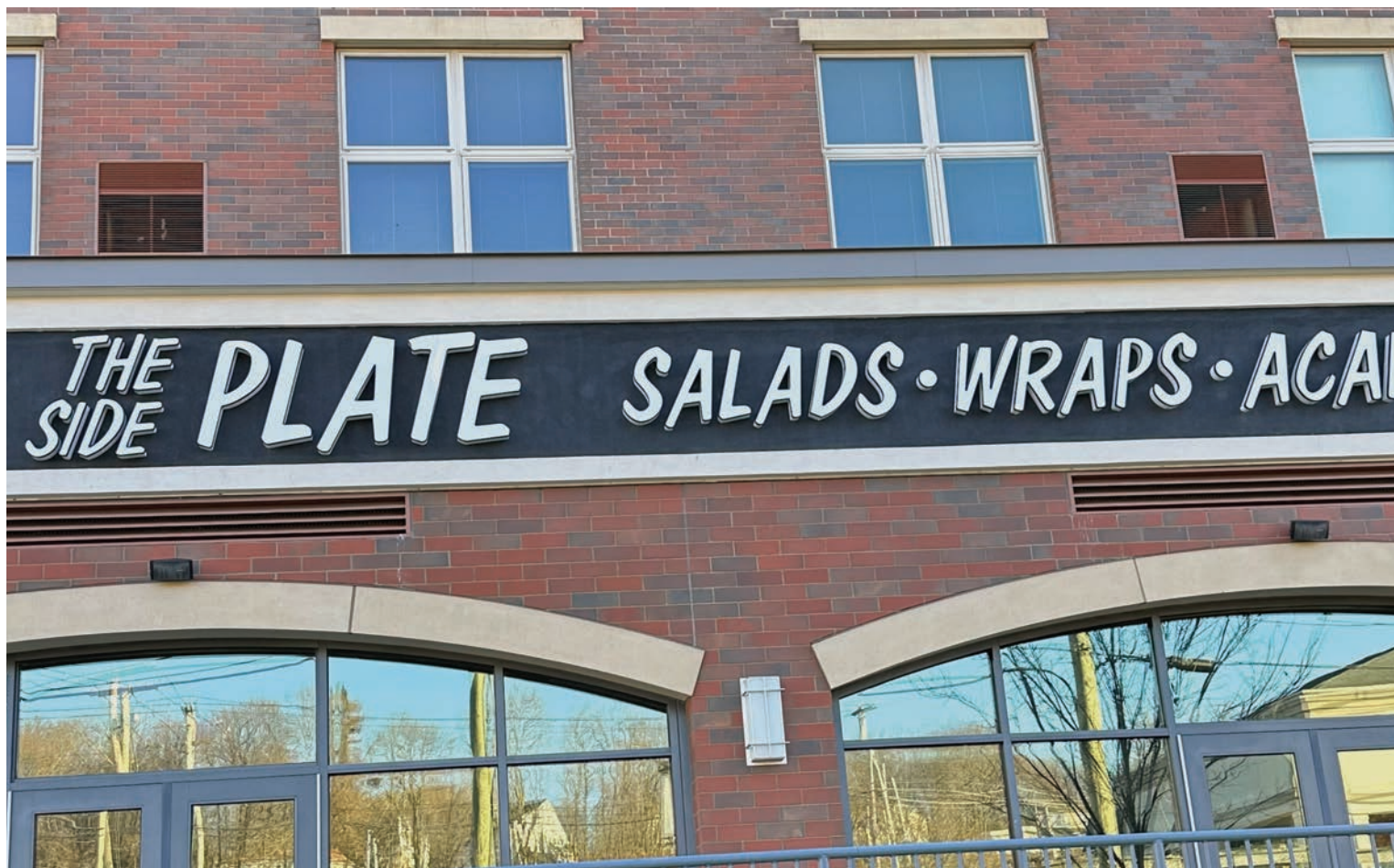
The new location for The Side Plate, West Haven, Feb. 3, 2023.

In 2020, at about the same time the university chose to bring in