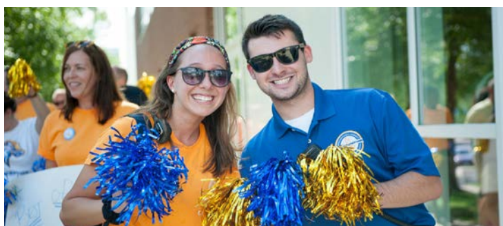
Welcoming the Class of 2023 to campus.