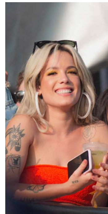
Halsey, one of the six women that received four or more nominations

Other awards include Best Pop, Best Hip-Hop, Best R&B, Best Direction, and Best Choreography, among others. Catch the awards live tonight on MTV.