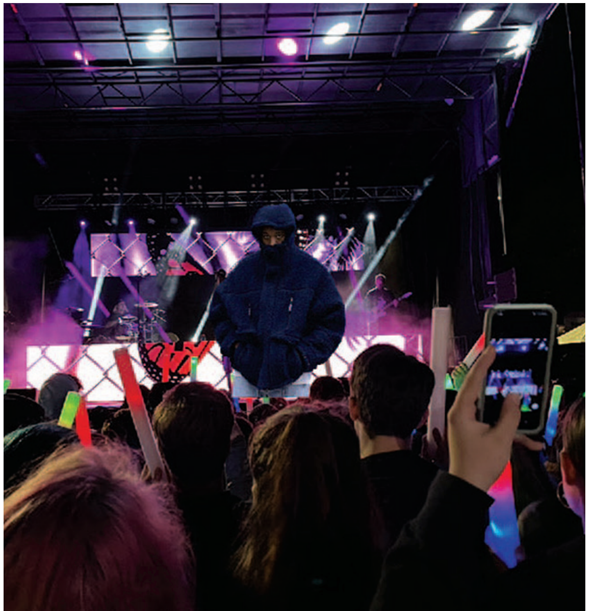
Ye takes on West Haven.

No matter what your opinion is on this "situation," this Spring Week is certainly set for high levels of activity. Tickets for the concert are available from 7 a.m. on Friday, April 7 until 11:59 p.m. on Sunday, April 9. Tickets are free for full-time undergraduate and graduate students, and are distributed on a first-come, first-serve basis. Guest tickets are $10. We hope to see you there sporting either an artist T-shirt or a protest sign.