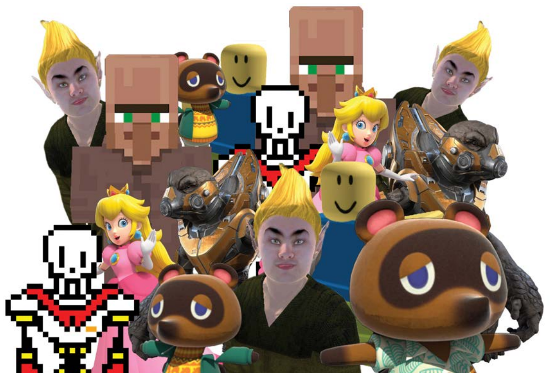
Jumpscare.

join me in taking them down. Some might argue that they are good for society because they are simple creatures and they magnify the redeeming qualities of humanity, but they are simply taking up too much space and must be stopped. Any contributions are appreciated as we look to take our planet back from the forces of robotic evil.