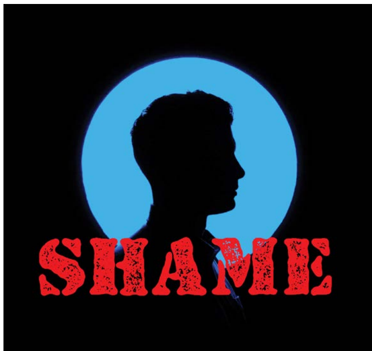
Man is shamed.