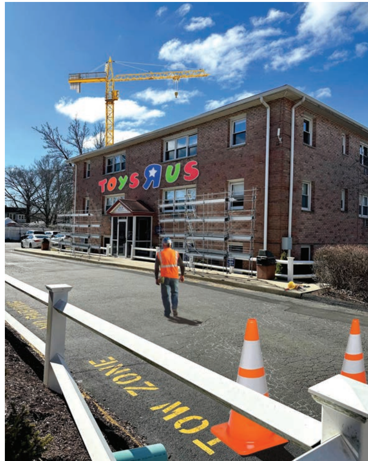
Construction commences, West Haven.

Romance, nostalgia and incredibly low student discounts have graced the university, making this collaboration a success.