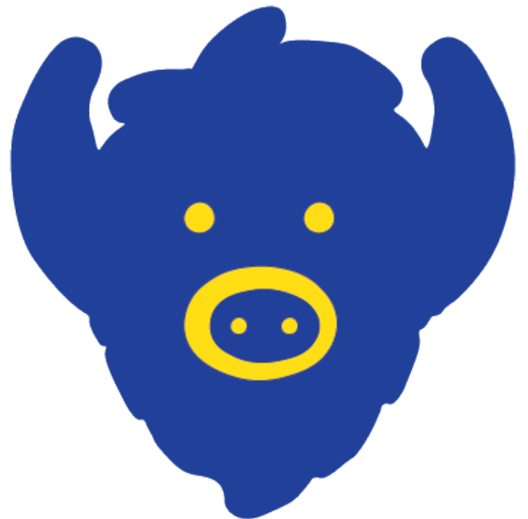
Charger x YikYak collab.

Yik Yak to act as pallbearer for grandpa Outlook, and lay this clearly outdated form of communication down to rest for good.