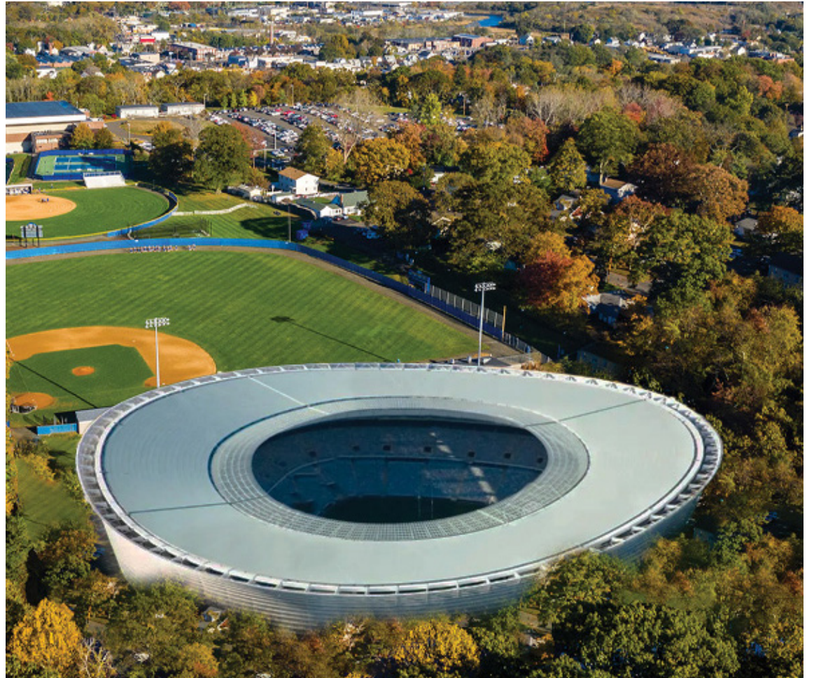
The shiny new eSports Arena, West Haven.

The university anticipates the Queen Pokimane Arena to be completed spring 2025.