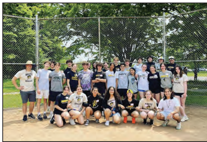
Amity Advocates volunteer at the 6th grade Field Day

Overall, the event was a success, as Amity students' participation helped introduce the 6th grade students from Bethany