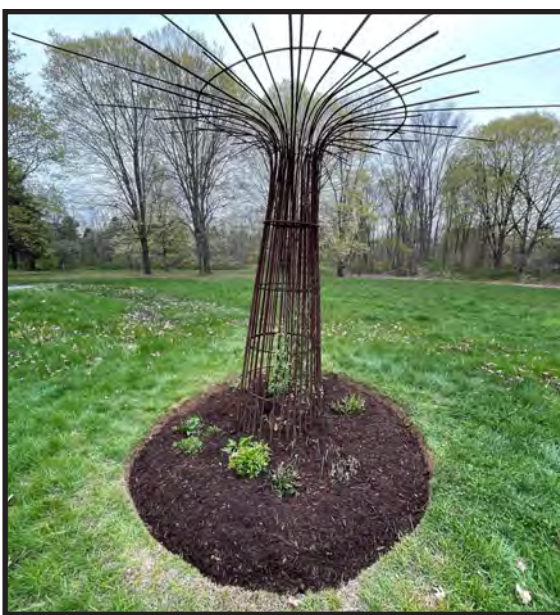
An example of services offered by Berke Landscaping.

He discussed how he started the landscaping