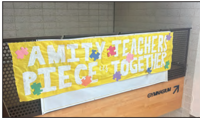
The Teacher Appreciation Banner.

Beyond teaching students lessons about their respective subjects, teachers put so much effort and passion into making students more knowledgeable, kind, and understanding people who can, in turn, succeed in their own lives.