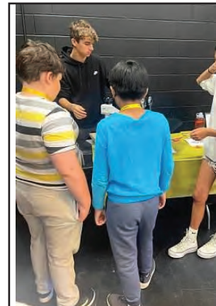
Amity and BOW students enjoy STEAM Day.

This demonstrates the positive effects STEAM Day has on both elementary and high school students, faculty, as well as our community, by educating children about STEAM's significance and potential applications for students in the future.