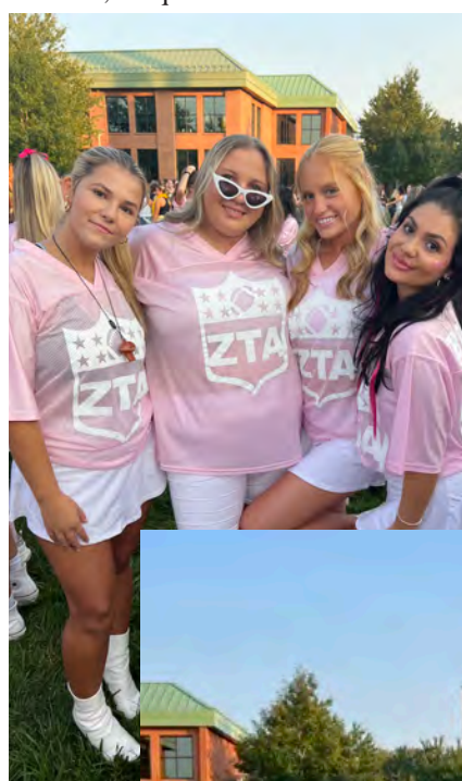
Zeta Tau Alpha sister's came together for Bid Day after a wonderful Recruitment Weekend.