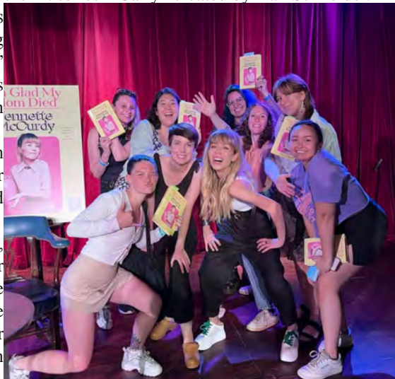
Instagram, @jennettemccurdy Jenette McCurdy pictured with fans at her book release.

“I’m Glad My Mom Died” sold out within 24 hours of being available to sale retailers and shot to New York Times Bestseller, reported by Variety.