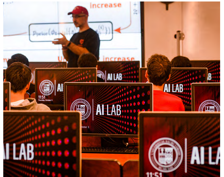
Sacred Heart University