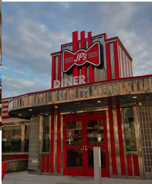
JP's Diner brings the true New Jersey style diner element to campus.