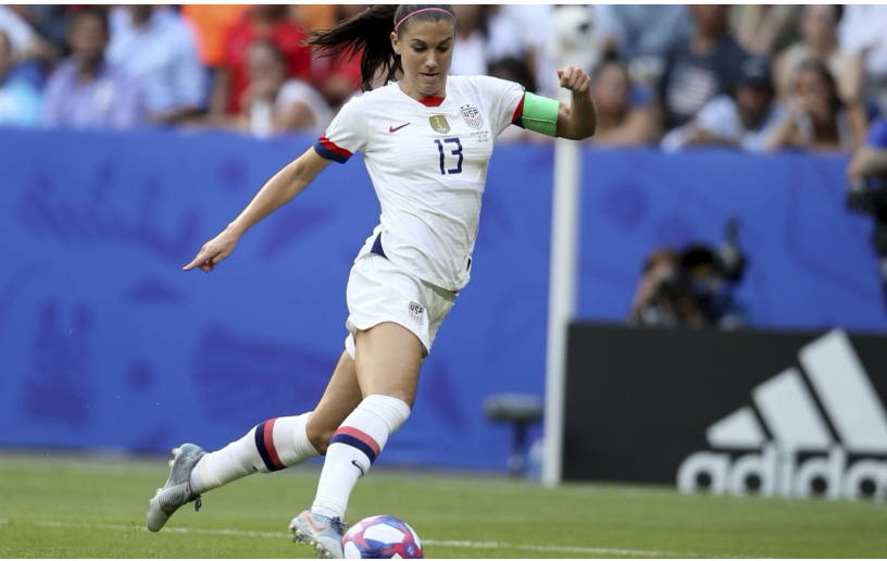
Alex Morgan, co-captain of the U.S. Women's National Team, has spoken out about the controversial decision to allow a sponsorship with Saudi Arabia for the 2023 FIFA Women's World Cup.