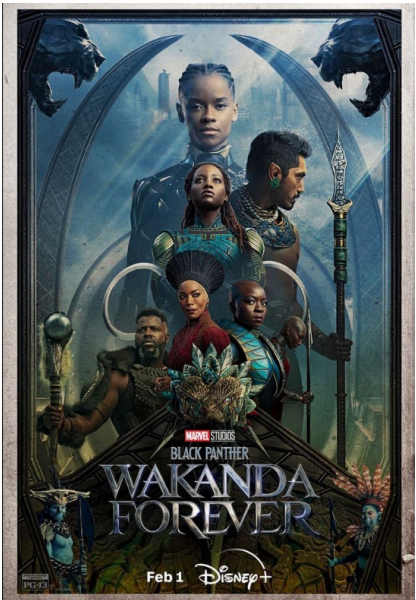
Instagram, @blackpanther Official movie poster for the Black Panther sequel.