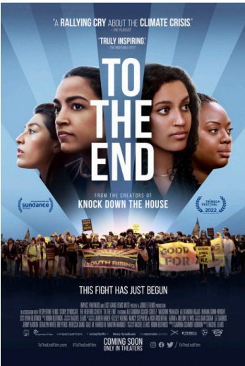
Film poster for the documentary, “To The End,” that follows female climate change leaders.