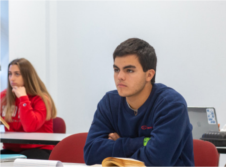
SHU Students studying in the Humanities Center of the Main Academic Building.