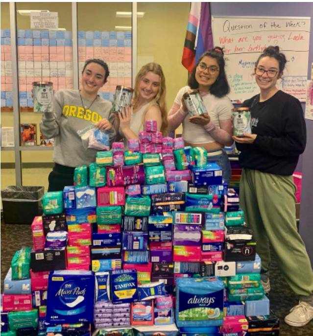
Instagram, @womens.alliance.shu Members of the WEA running a drive for period products to support women in need locally in Bridgeport and internationally in Ukraine.