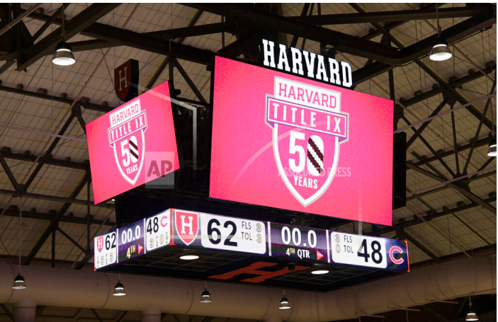
ALLSTON, MA - DECEMBER 03: A general view of the Harvard Title IX 50 Years logo on the jumbotron following a women’s college basketball game between the Colgate Raiders and the Harvard Crimson on December 3, 2022.