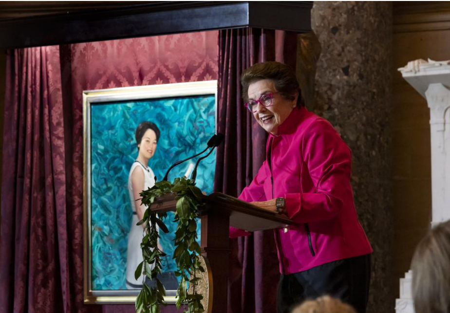
Billy Jean King, tennis icon and gender equality advocate, speaks after helping unveil a portrait of the late Rep. Patsy Mink of Hawaii, the first Asian-American woman elected to Congress and who helped pass the Title IX Amendment to prohibit sex-based discrimination in federal programs, at the Capitol in Washington, Thursday, June 23, 2022.

2022: South Carolina’s Dawn Staley becomes the first Black Division I basketball coach, male or female, to win more than one national championship. The U.S. women’s national soccer team reaches a milestone agreement to be paid equally to the men’s national team.