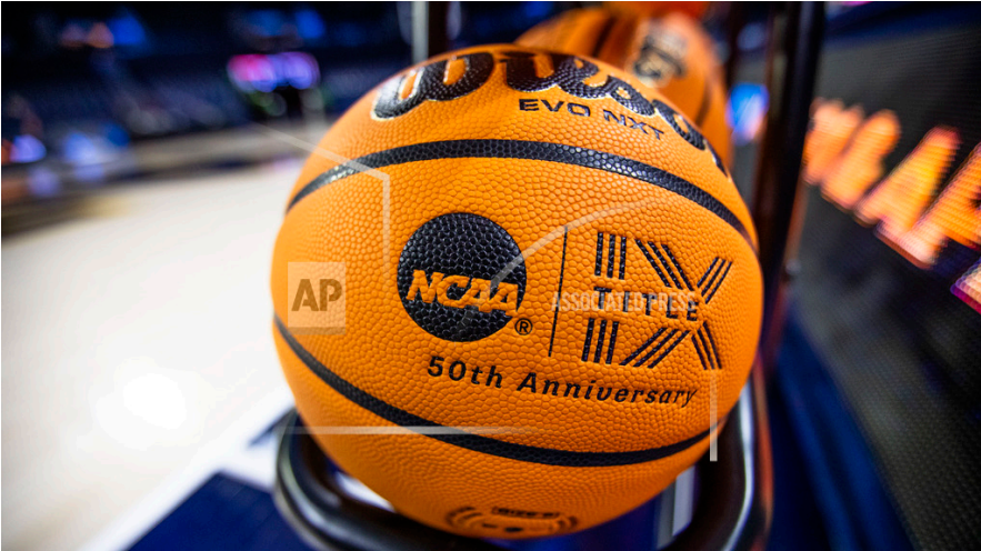
A basketball with an NCAA logo and a Title IX inscription rests on a rack before a First Four game between Illinois and Mississippi State in the NCAA women’s college basketball tournament Wednesday, March 15, 2023, in South Bend, Ind.

“No person in the United States shall, on the basis of sex, be excluded from participation, in be denied the benefits of, or be subjected to discrimination under any education program or activity receiving Federal financial assistance.”