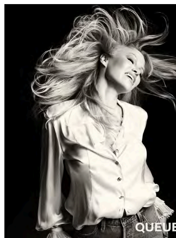
Pamela Anderson posing for a playful shot for Queue amidst the release of her documentary.