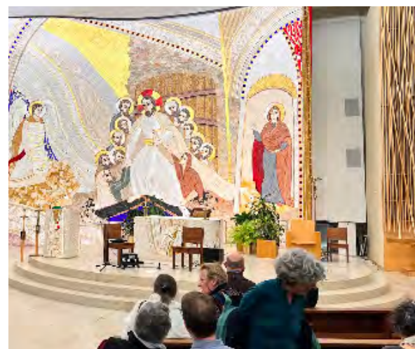
Chairs and microphones placed during concert set up on Feb. 22 in the Chapel of the Holy Spirit.