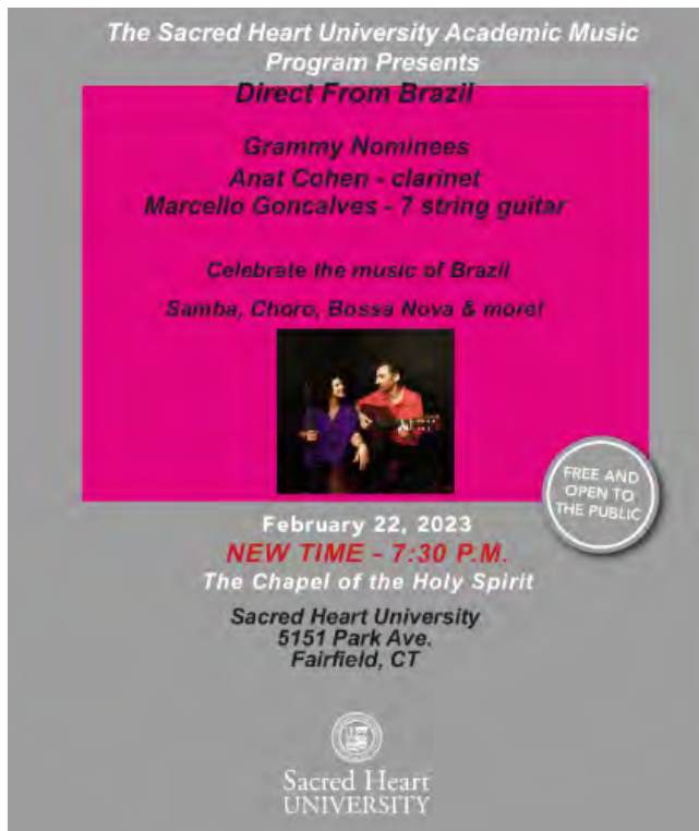
Promotional poster for the "Direct From Brazil" event.

It was a cold, rainy evening at Sacred Heart University (SHU) on Feb. 22. Some on campus might have heard the crackling of a drizzling rain or the whistle of a cold wind, but for those in the Chapel of the Holy Spirit, they heard nothing but the warm melodies of Brazil.