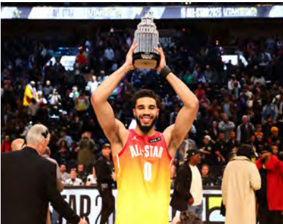
Jayson Tatum poses with the NBA All-Star MVP trophy.