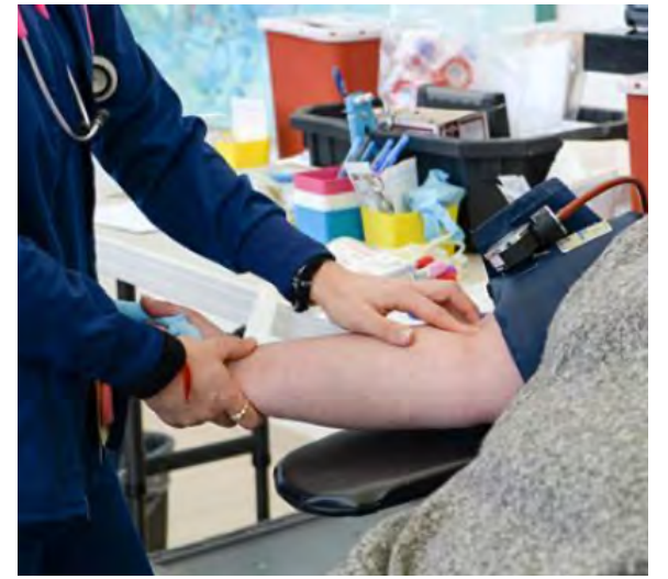
Sacred Heart students and faculty were able to give blood at West Campus.

If you are interested in donating blood this semester the SNA will be hosting two more blood drives, one on March 13 from 9 a.m. to 2 p.m. and one on April 18 from 8:30 a.m. to 6:30 p.m.