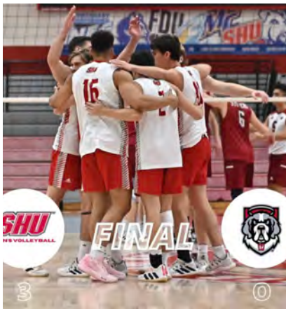
The SHU men's volleyball team celebrates after defeating D'Youville University 3-0.