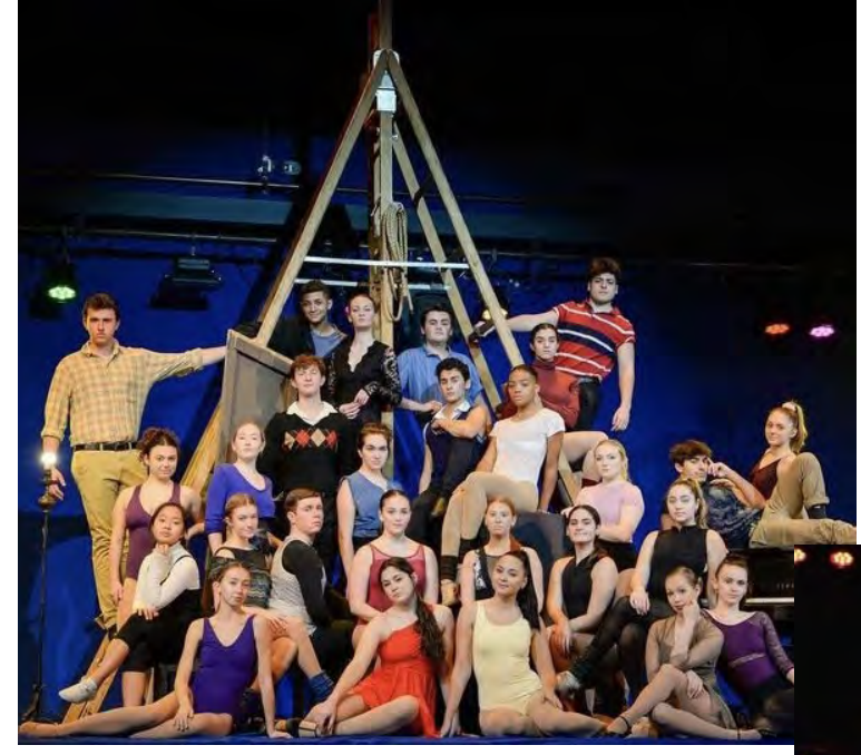
The dedicated cast of "A Chrous Line" made up of members of the Sacred Heart University Theater Arts Program.

The musical centers a group of dancers from all different backgrounds who are auditioning to become members of the chorus line in an upcoming musical. Broadway During their time there, the director, Zach, asks the performers to talk about their life experiences. Some of the stories are comedic,