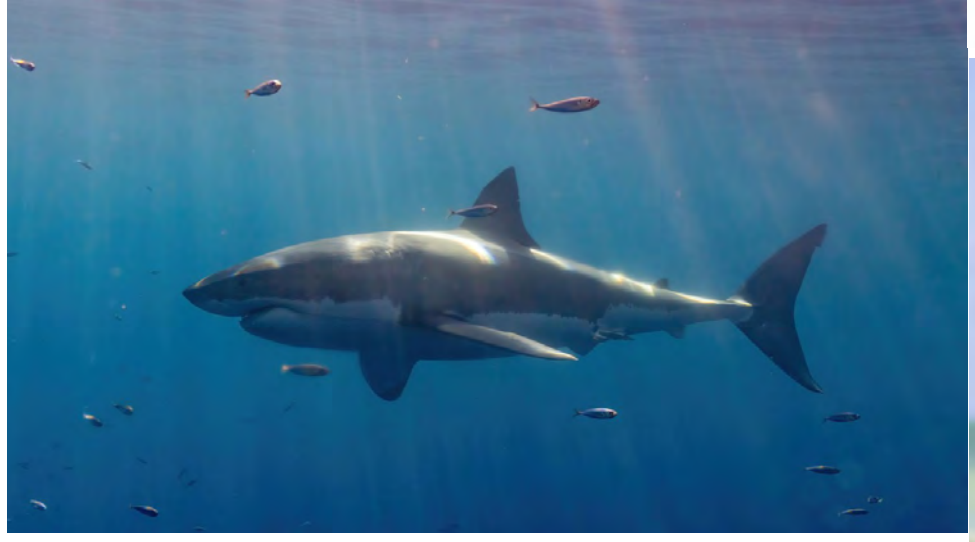
Contributed by Tomas Koeck

TICKETS AND INFO: WWW.SHUCOMMUNITYTHEATRE.ORG • 203-371-7956