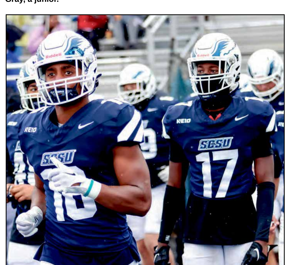
The Owls take the field for their Homecoming game versus AIC.