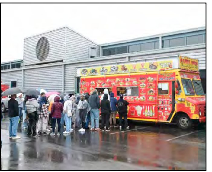
Attendees line up at the food truck Santa Ines.