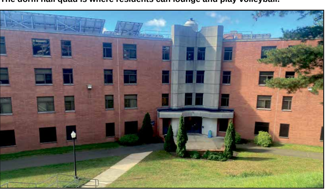
The dorm hall quad is where residents can lounge and play volleyball.