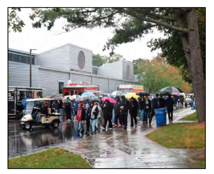
The Owls community walking in the rain.