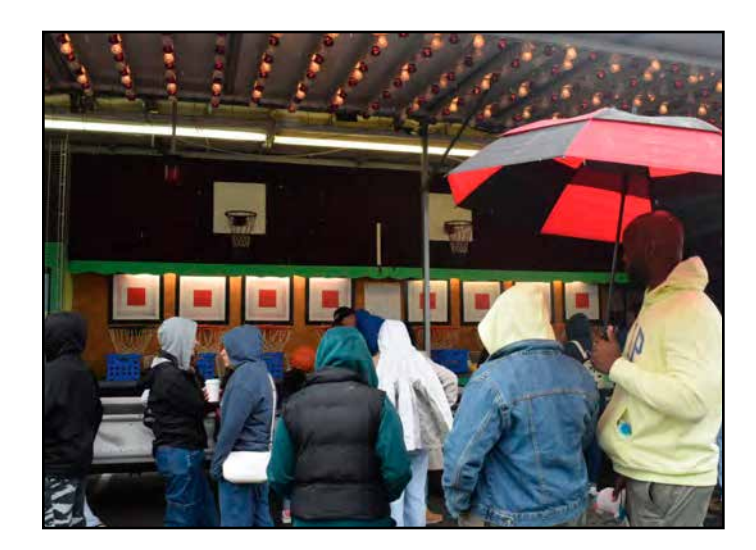
The Owls community playing carnival games.

Students, alumni and family of the university gathered before the Homecoming game on Oct. 14. Despite the rain, the community still enjoyed food trucks and carnival games before the big game.