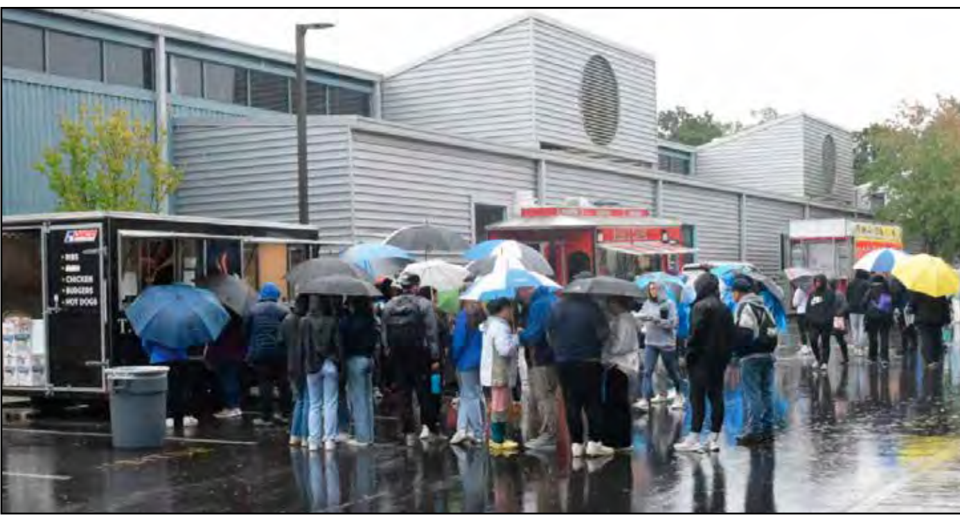
Attendees gathered outside of Moore Field house in the rain, waiting in line for the food trucks.