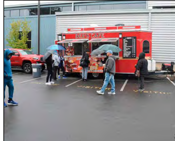
Attendees lines up outside of Deb's Cafe food truck.