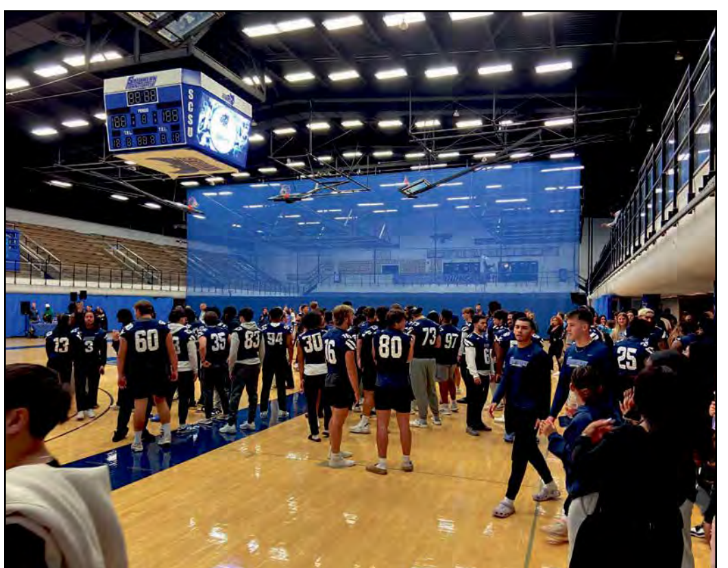
The football team stands in the middle of the gymnasium ready for the pep rally.