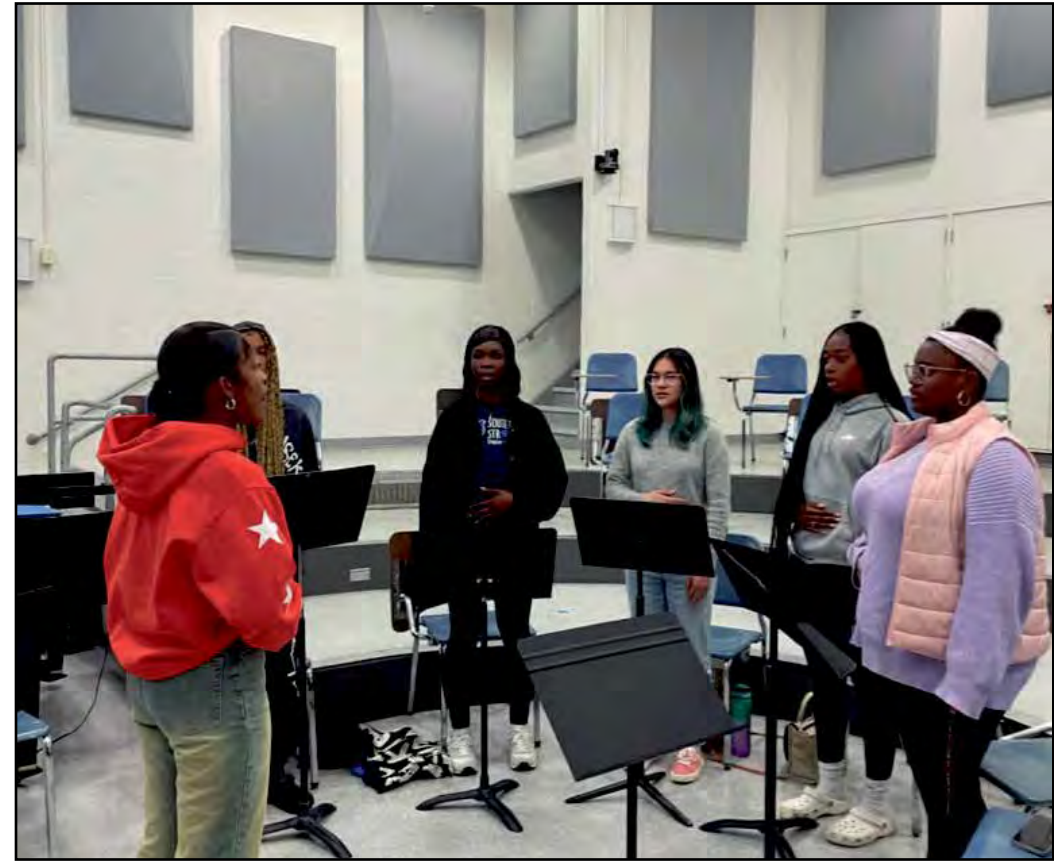
Choir students rehearsing in a classroom in Earl Hall.

Because Boone had been used to playing the drums, he considers playing the bass more