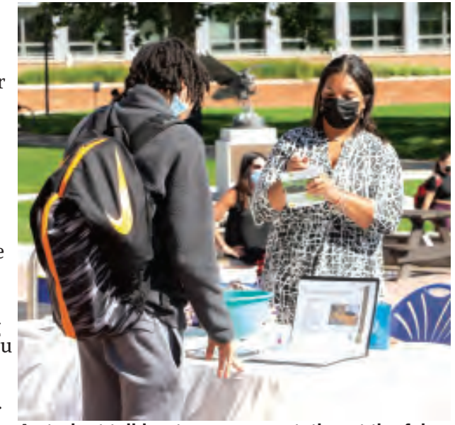
A student talking to a representative at the fair.

If you want to read more about the Wellbeing Fair, go to page 1 and if you want to read more about "Apple Cider and Donuts with ProCon"go to page 8 with ProCon"go to page 8.