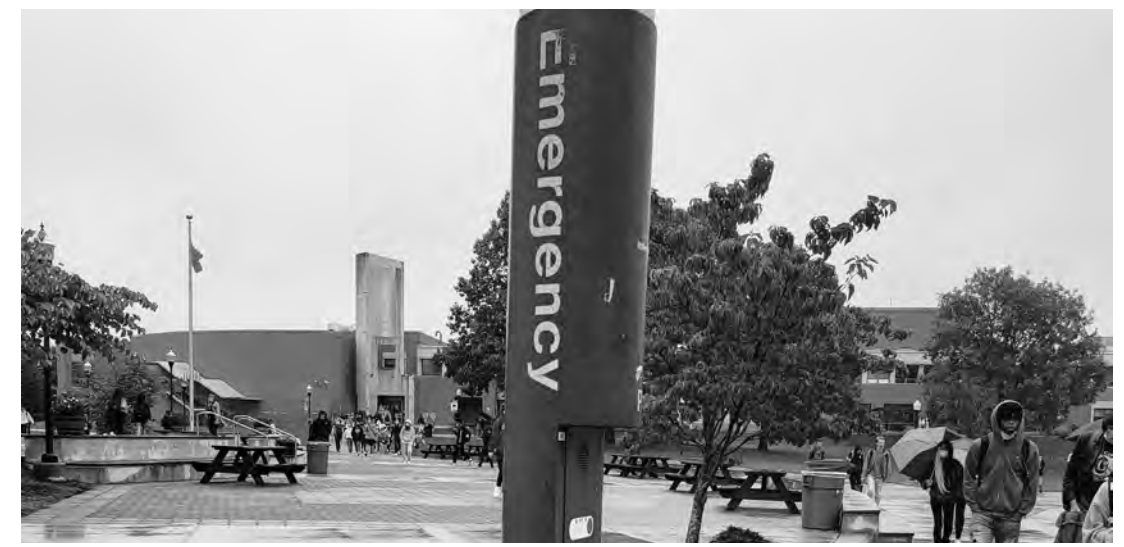
One of the emergency buttons around the university used to contact university police.