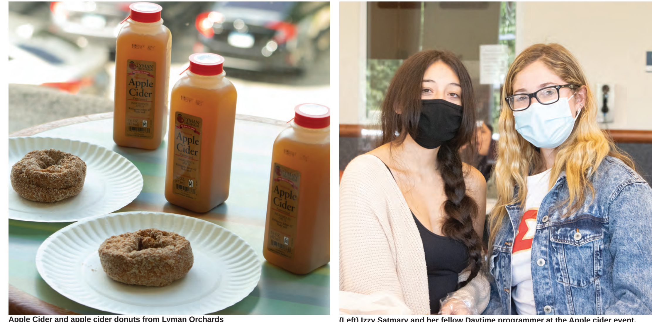
Apple Cider and apple cider donuts from Lyman Orchards