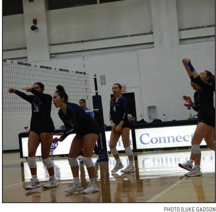
The Owls celebrate after scoring a point.