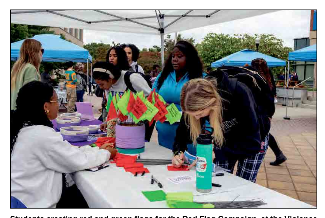
Students creating red and green flags for the Red Flag Campaign, at the Violence Prevention, Victim Advocacy and Support, VPAS, Center's table.