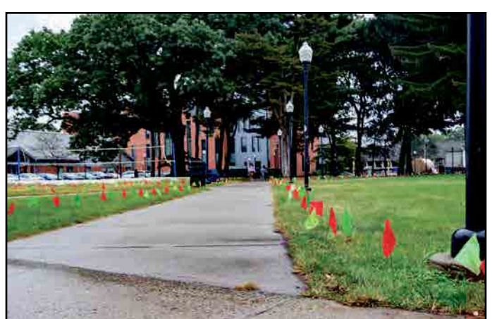
Red and green flags made by students, displayed in the Residence Quad.