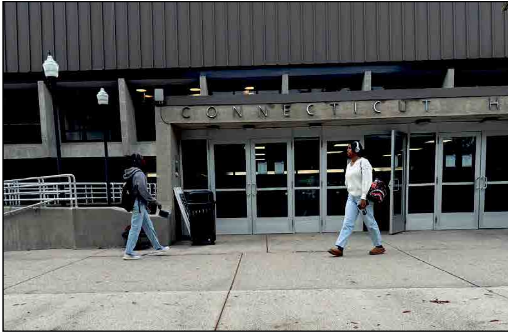
The outside entrance of Schwartz Residence Hall.