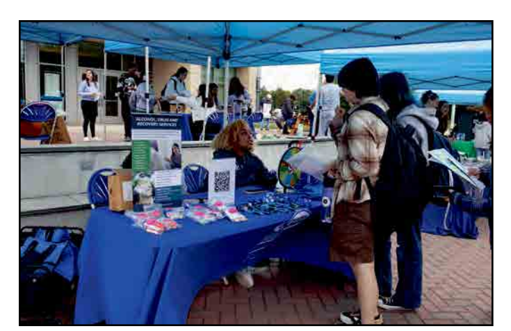
Students visiting the Alcohol, Drug and Recovery Services' table.