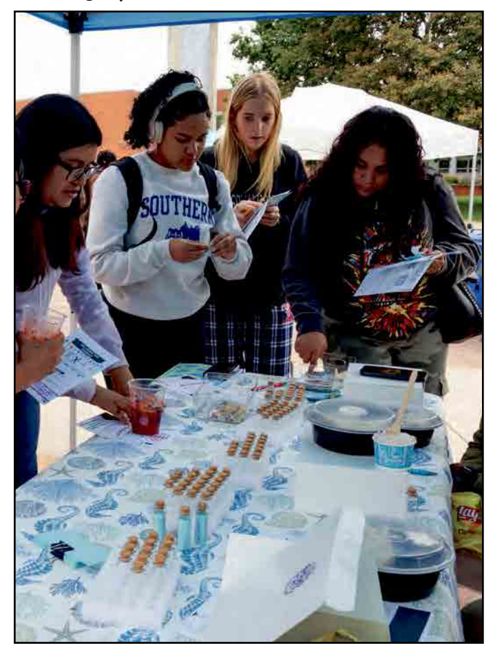
Students creating their affirmations in a bottle at the Centers for Intercultural Engagement's table.

One of the offices, the Violence Prevention, Victim Advocacy and Support, VPAS, Center, participated in the event as a part of their ongoing Red Flag Campaign. The campaign, which lasted all of September, focused on raising awareness on healthy personal connections and romantic relationships. Students at the wellness fair wrote on red and green flags what they personally believed were red and green flags in relationships. These flags were then displayed around campus, and in the Residence Quad where the center was tabled the following day.