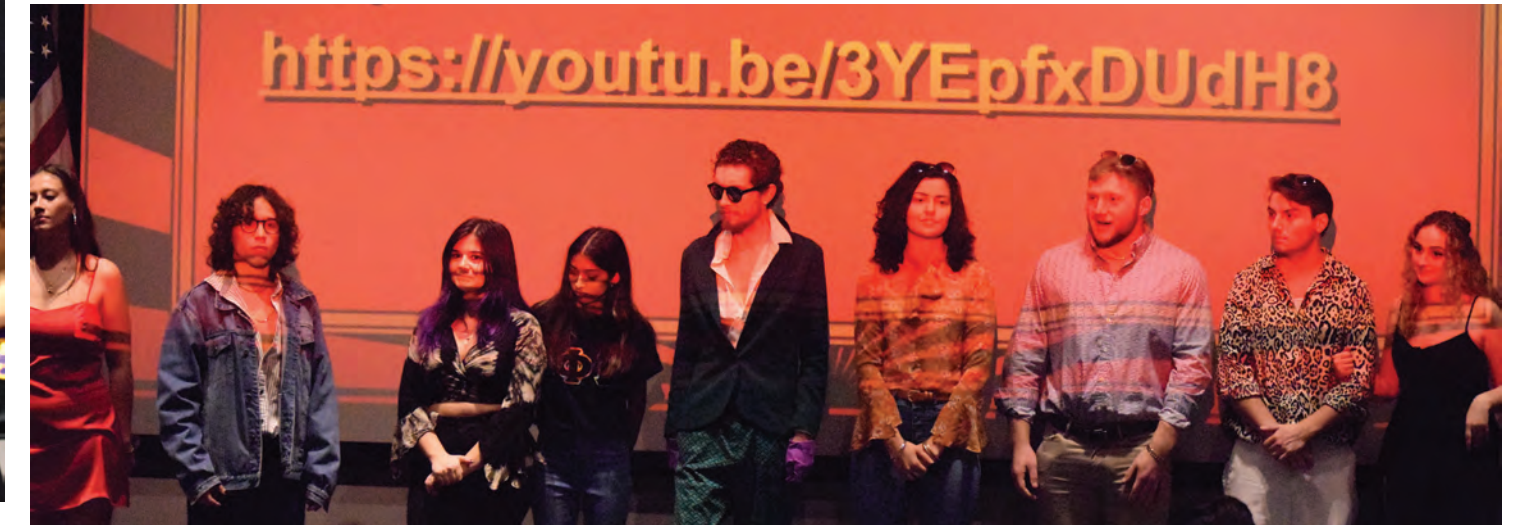
Delta Phi Epsilon sisters and "Deepher Dude" contestants standing on stage with a youtube link behind them.