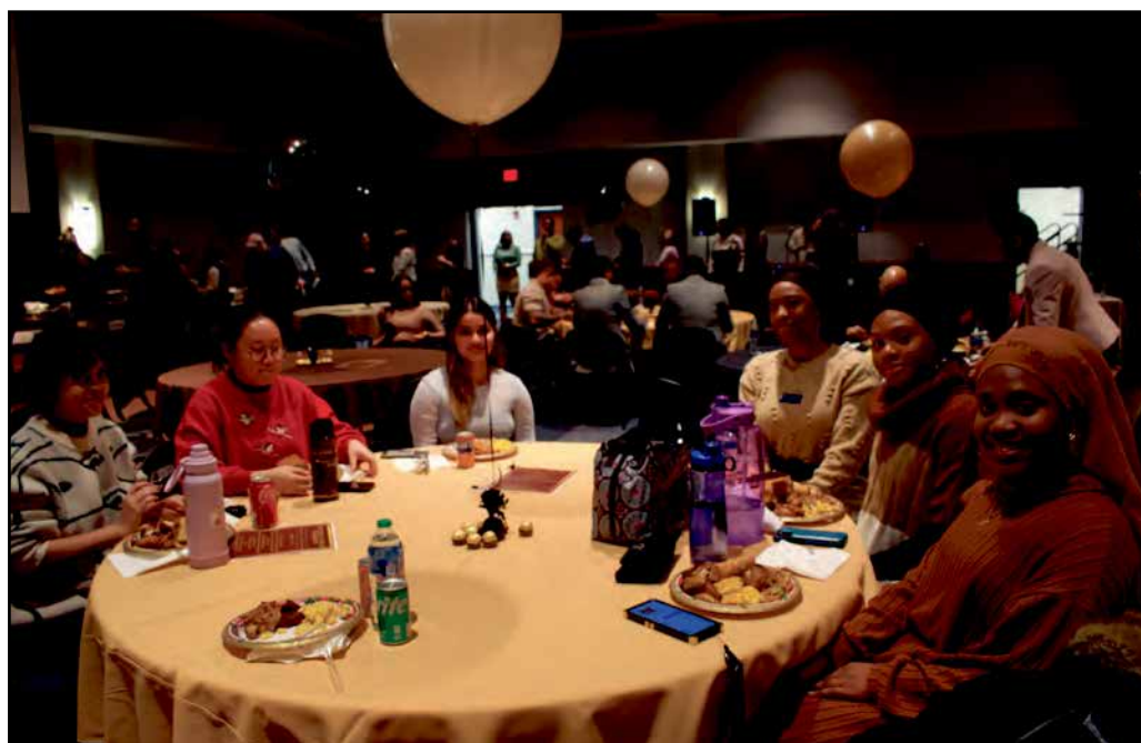
Students sitting at the table with food during the event on Nov. 2.