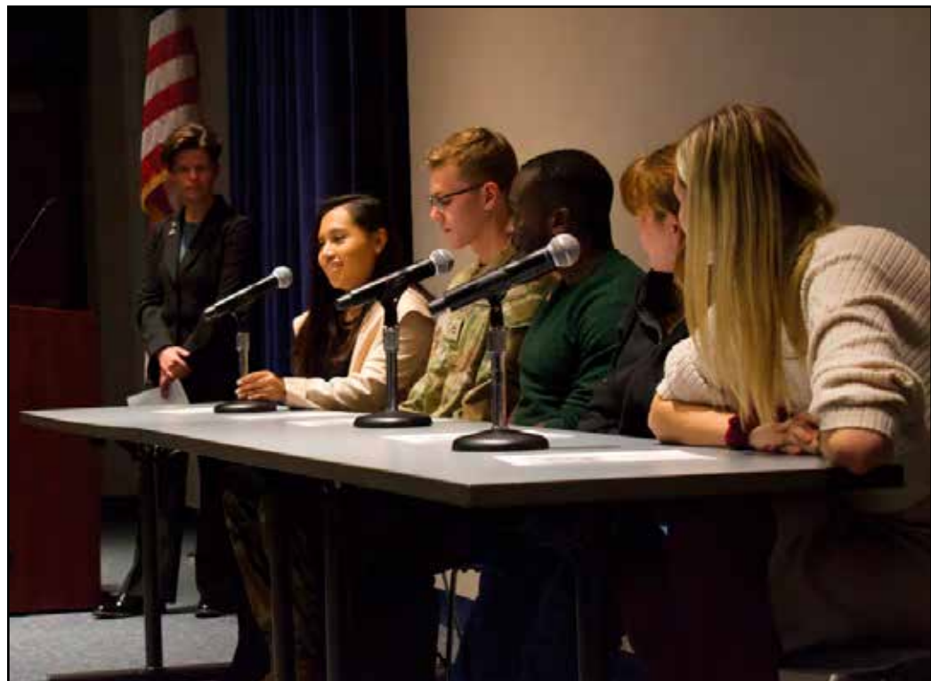
Panel hosts celebrating individuals of the US Military at the university's Veterans Day ceremony in the Adanti Student Center Theatre on Nov. 6.