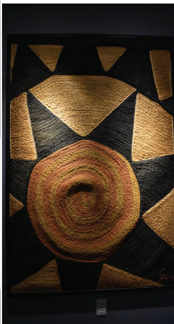
"Sun Tapestry" made by Alexander Calder.