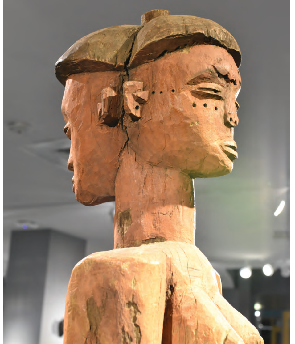
"Janus Couple Sculpture" by Yaka, Democratic Republic of Congo.