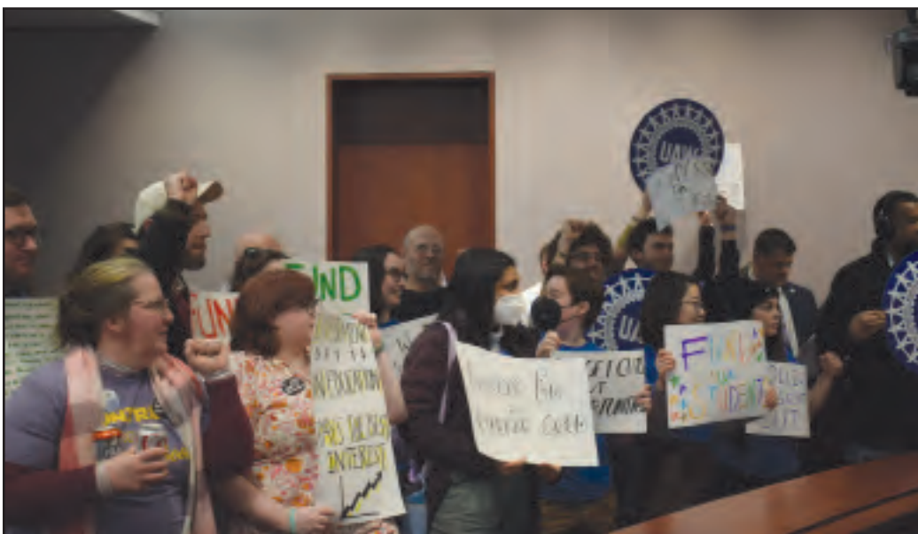
Press conference attendees holding up signs in support of Connecticut State Universities.