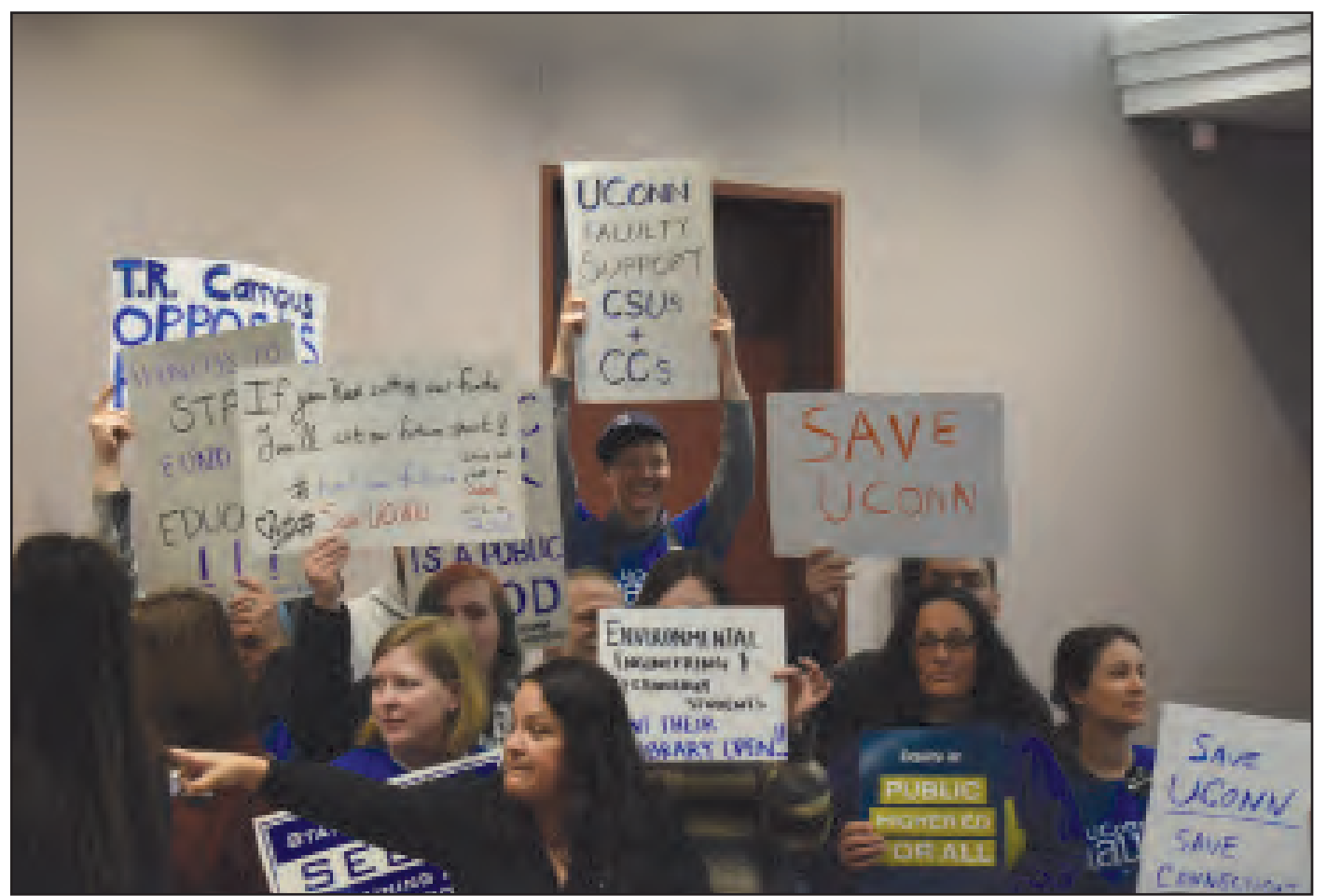
Attendees from University of Connecticut, Connecticut State Universities and the community colleges advocating for better funding.