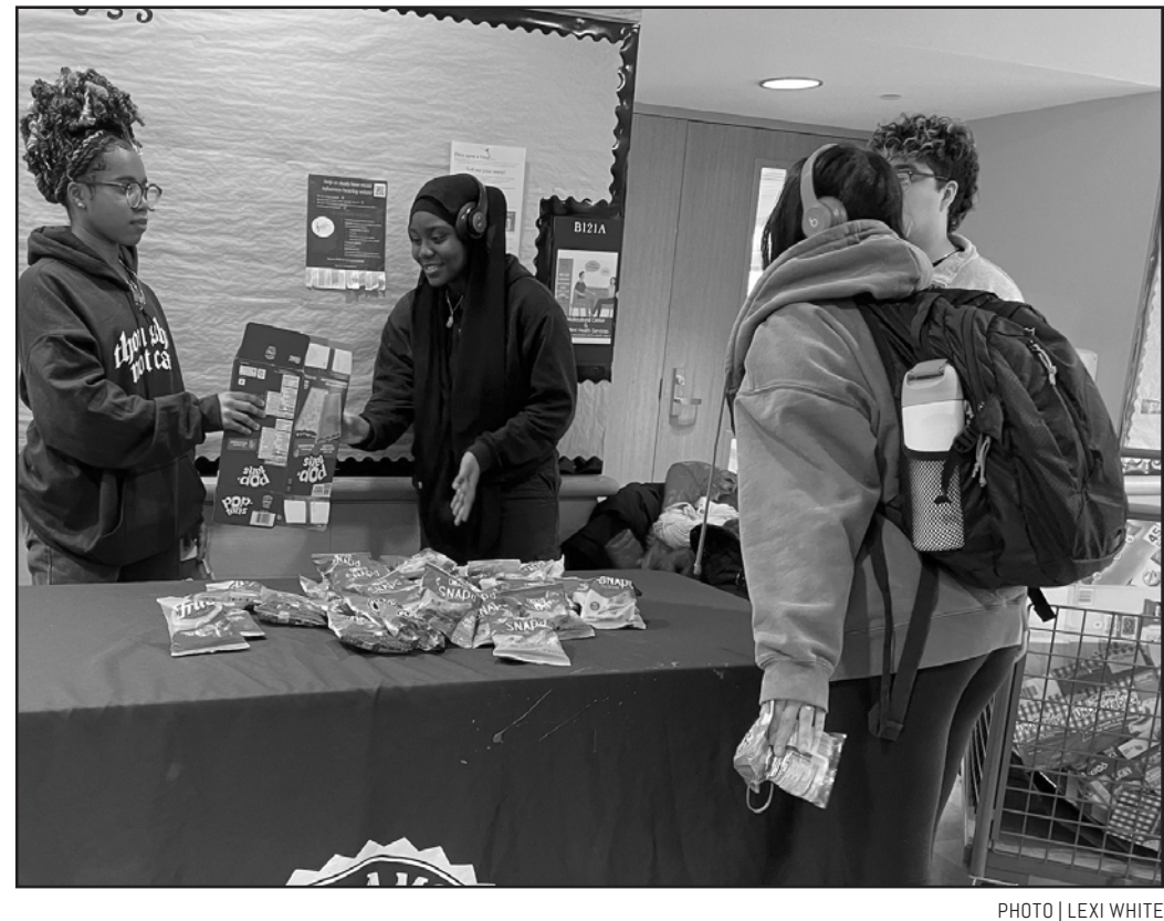
ProCon serving snacks for students in Engleman Hall on Thursday, Feb. 22.

the students on campus. ProCon has also been helping students with