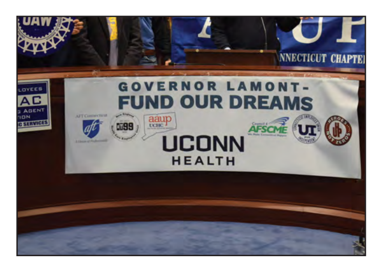
Attendees holding a sign advocating for better funding for higher education.