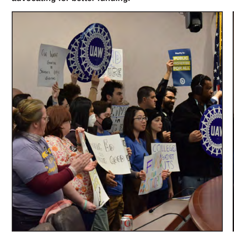
Signs raised in support of higher funding for colleges.