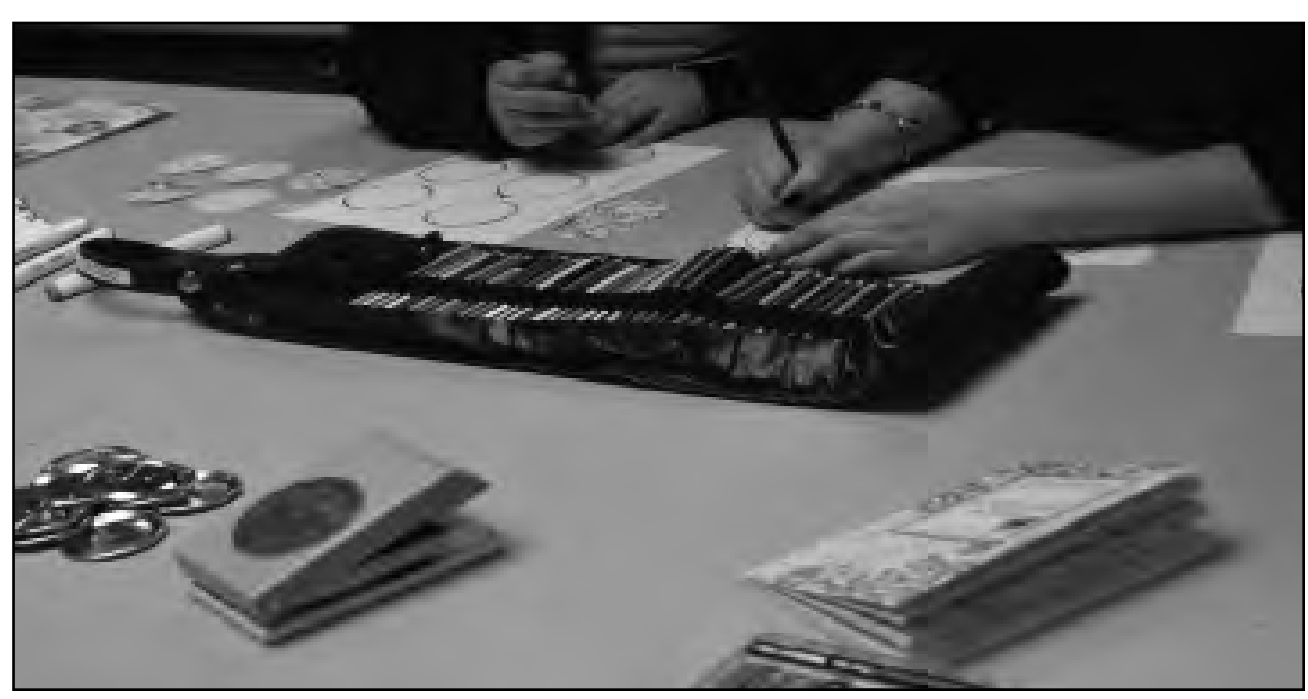
Students coloring and creating designs for their pins and magnets. Some students used coloring books or magazines, and others created designs from scratch.