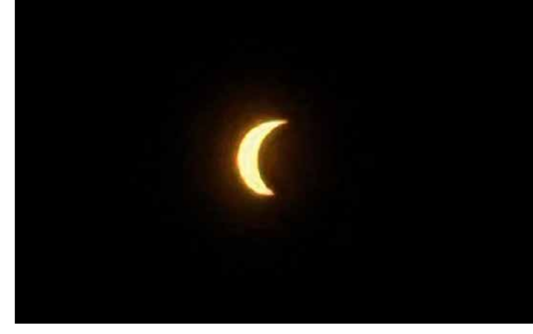
The sun and the moon lining up on April 8.

For many students, the eclipse serves as a humbling reminder of