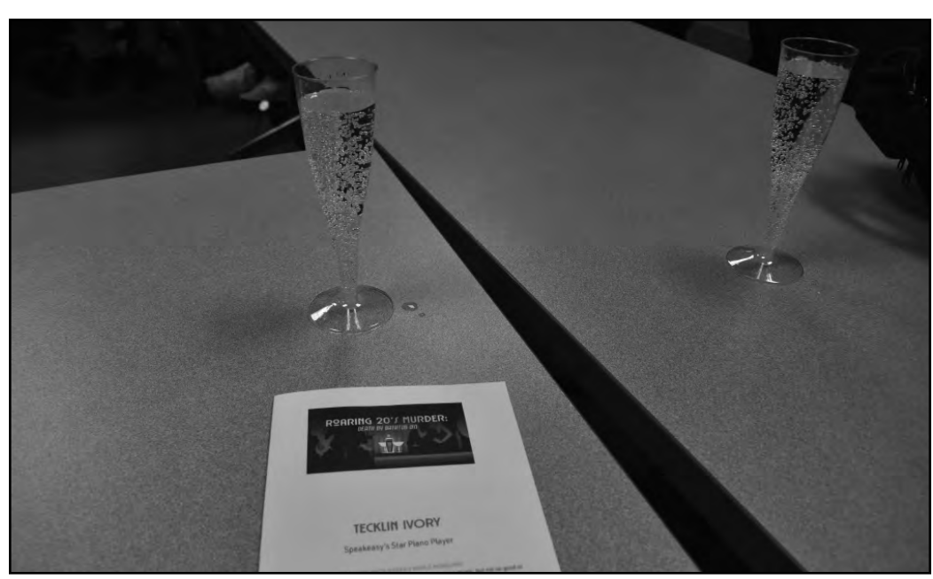
Refreshments and scripts were given to attendees acting out the murder mystery.