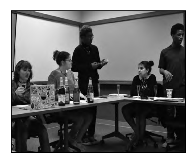
Students acting and serving drinks.