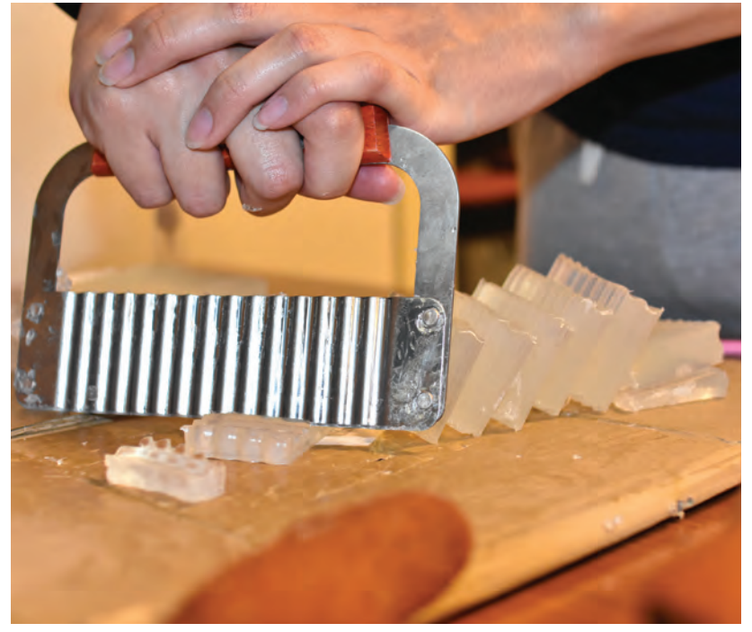
Soap being cut.