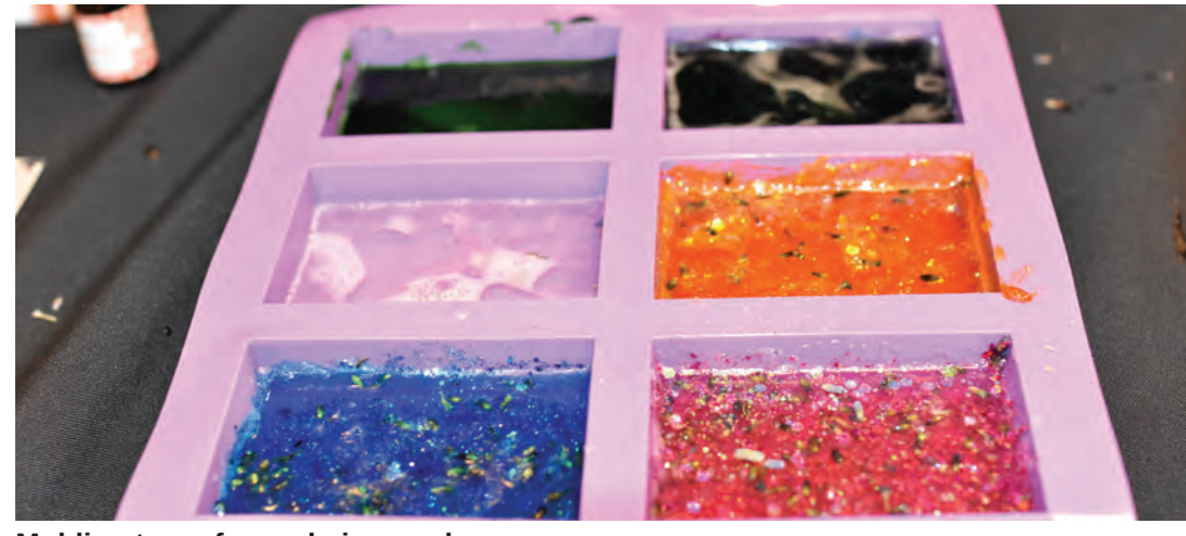
Molding tray of soap being made.

Different colors and glitters were avaliable for the students to pick out. They were put into the mold to