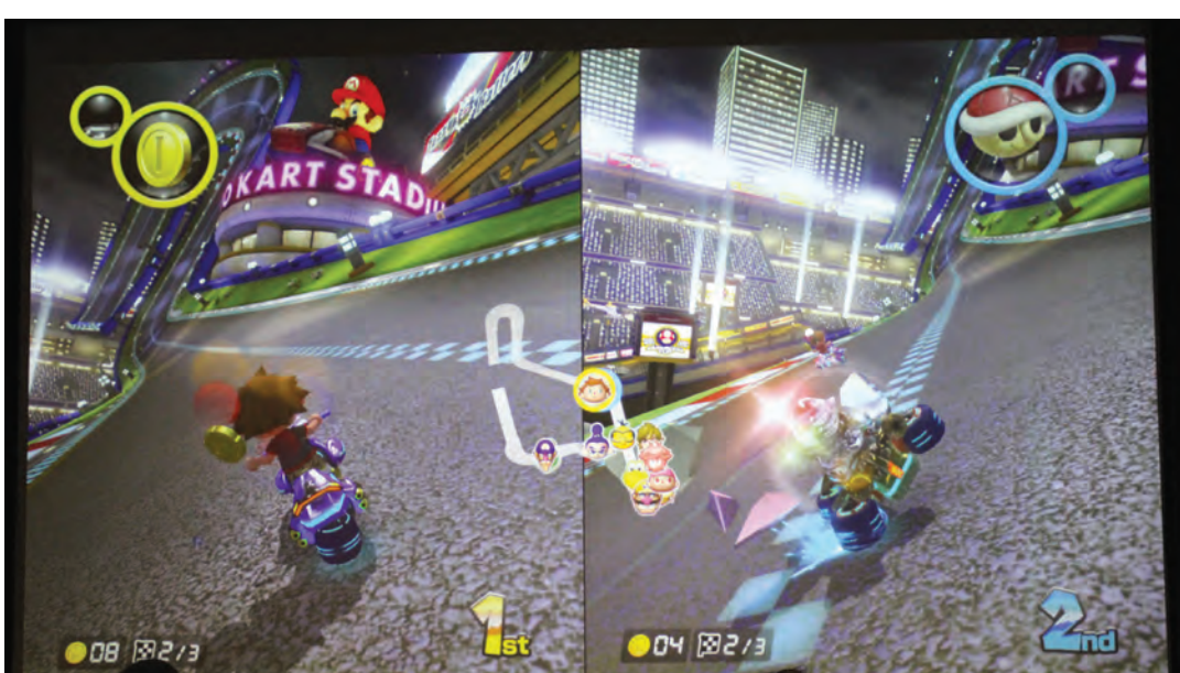
Students competing agaisnt eachother head-to-head.