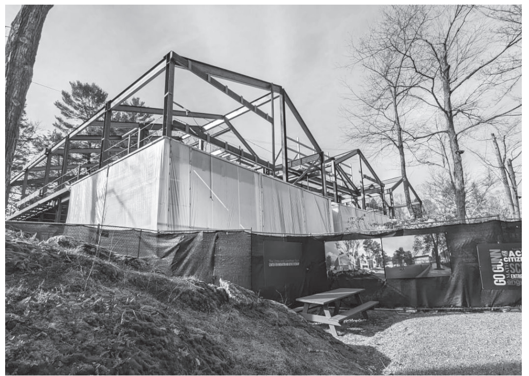
The Lizzie under construction

I've never been to Europe and I hate seafood!