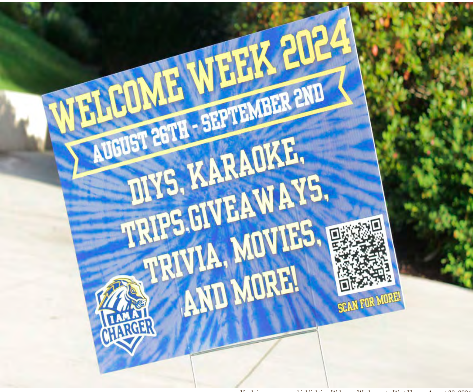
Yard sign on campus highlighting Welcome Week events, West Haven, August 30, 2024.

However, a major highlight of the week went to the annual Involvement Fair. For those who did not attend, this event takes place in the Maxcy Quad and features every on-cam-