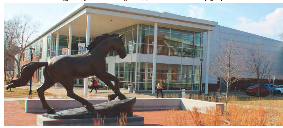
The Charlie the Charger statue in front of Beckerman Recreation, West Haven

We are excited to see new writers in our bylines and watch you grow as writers and people. Being a part of these organizations gives you skills you will hold on to even after college. I encourage you to get involved no matter what your major or what you plan on doing after college. If you're interested, please contact chargerbulletin@newhaven.edu and we will be there to help get you started.