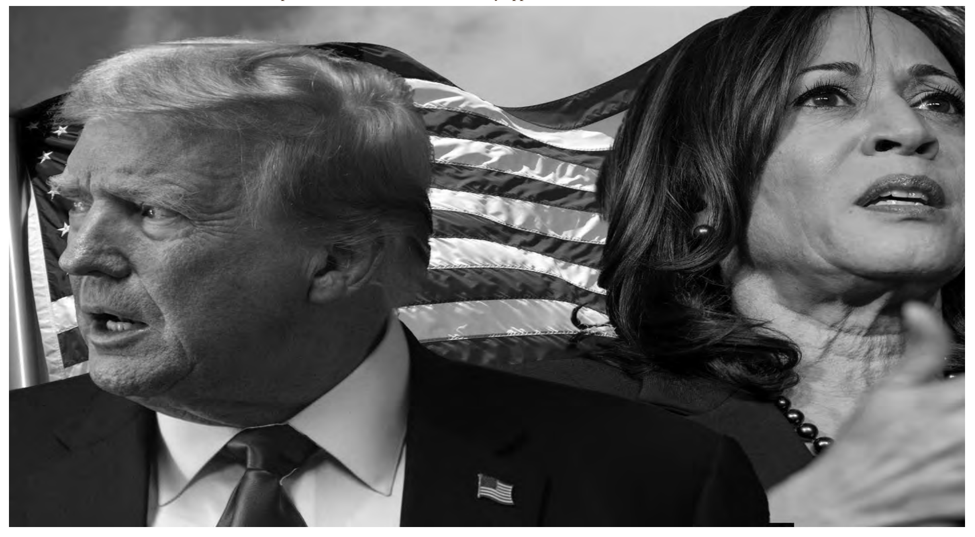
Former President Donald Trump and Vice Presidennt Kamala Harris in front of American flag, West Haven, Sept. 10, 2024.

After the Sept. 10 debate, another debate will follow between the Vice Presidential candidates on Oct. 1 for JD Vance and Tim Walz. It will be sanctioned and moderated on Columbia Broadcasting System (CBS). To access reliable voter information and stay current with the latest developments, individuals can consult official election resources, trusted news sources and local election offices.