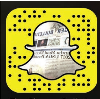
The Charger Bulletin chargerbulletin | 125

"Until that beautiful day happens, we must not back down," said Simmons.