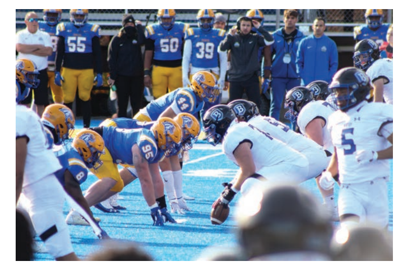
The New Haven defense lines up against Bentley University,, West Haven, Nov. 20.