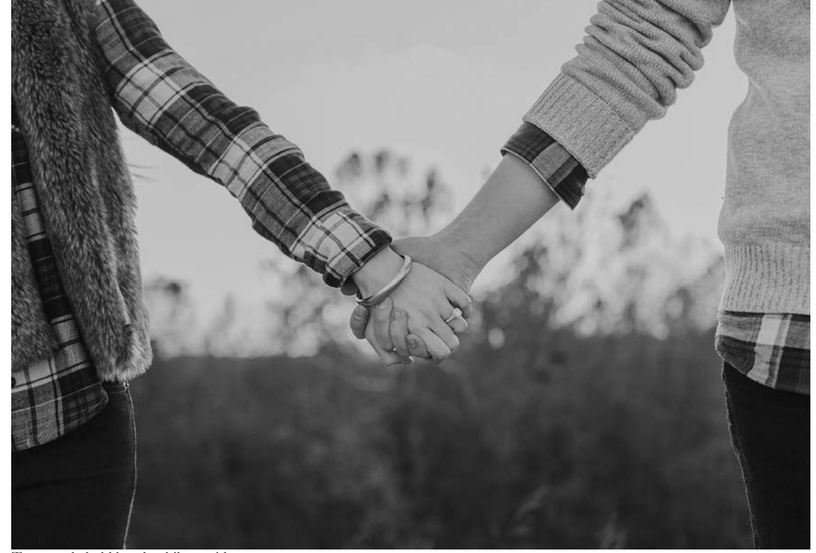
Two people hold hands while outside.

Being in a relationship requires a copious amount of commitment, dedication, communication and loyalty. However, it is easy to recognize when couples are struggling with their communication, which often happens at the beginning of the relationship when they are still learning about each other. Although there are problems that every couple faces at the beginning of their relationship, it becomes easier when you figure out the best way to communicate and stay committed to your partner. You've heard it said before that "actions speak louder than words," and in the case of relationships, this statement remains true. A relationship can only survive if each person is whole-heartedly willing to compromise, make sacrifices and