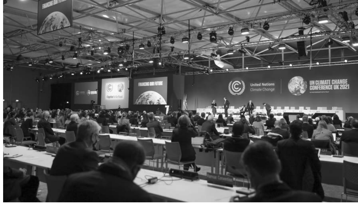
Inside of the U.N. Climate Change Conference, Glasgow, Scotland, Nov. 3, 2021.

Throughout the event, numerous speakers discussed issues pertinent to halting climate change, including U.K. Prime