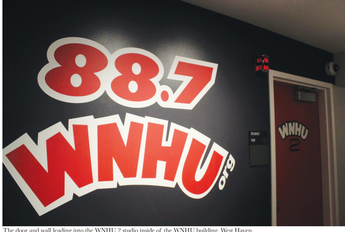
The door and wall leading into the WNHU 2 studio inside of the WNHU building, West Haven.

Students can get involved in WNHU in any way imaginable: passion projects, podcast production, broadcasting on the 88.7 f.m. stream, selecting music for the stream, website operation or even independent studies. There is also potential for paid