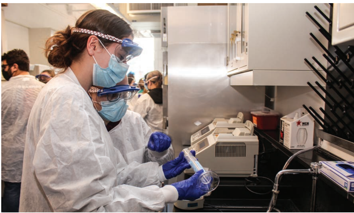
Students work inside a forensic science lab at the University of New Haven, West Haven.

"The faculty within the department allows for a more realistic expectation of a potential future career in a field related to foren-