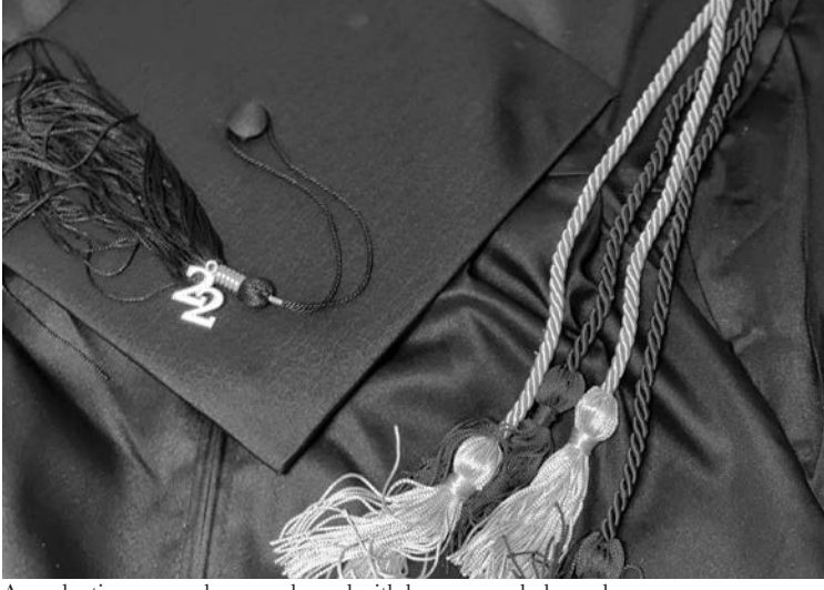
A graduation cap and gown adorned with honors accolade cords.

Comparing our 3.3 GPA program requirement to others in the area, Quinnipiac University requires a matching 3.3 throughout students' time of enrollment; the University of Connecticut requires a 3.0 by the end of freshman year, 3.15 by the end of sophomore year, and 3.3 by the end of junior year. For comparison, the University of New Haven has an 83% acceptance rate while Quinnipiac has a 70% acceptance rate, and UConn has a 49% acceptance rate. For a less competitive school overall, the university actually has a more competitive honors program numerically.