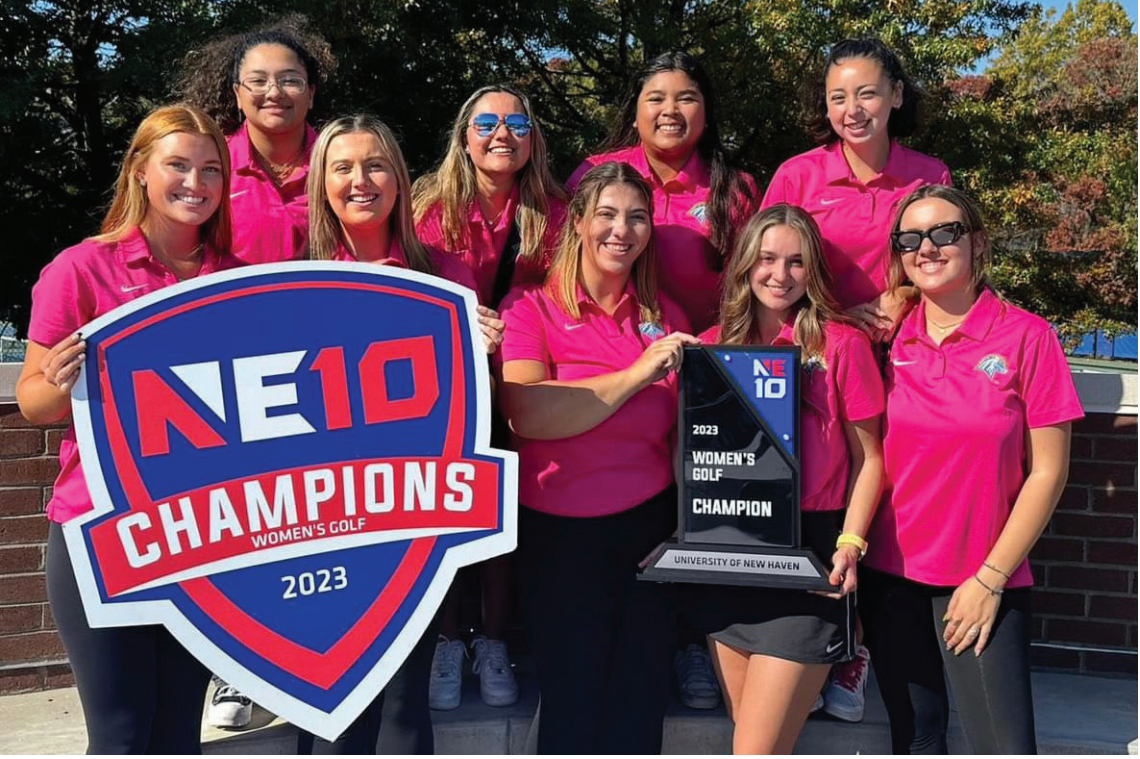
The New Haven women's golf team celebrating their first NE-10 title, West Haven, Nov. 1, 2023.

"There's a Navy Seal philosophy that I love, it's that you never rise to the occasion, what you do is you fall back to your level of training," said Ward. "So, if we train at a level that's consis-