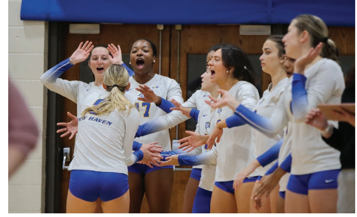
New Haven celebrates during their 3-0 sweep of SCSU, West Haven, Nov. 3, 2023.