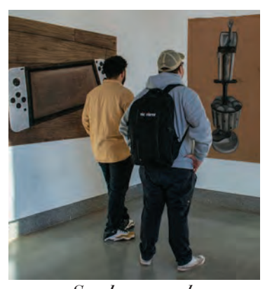
Student art showcase ARTS & LIFE, page 4