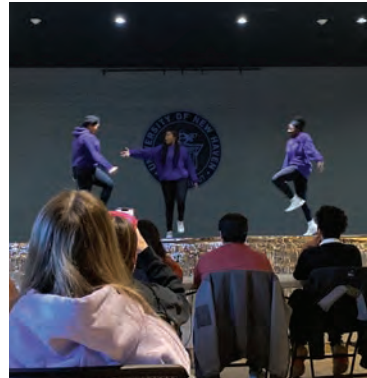
Dance Dance Evolution ARTS & LIFE, page 3