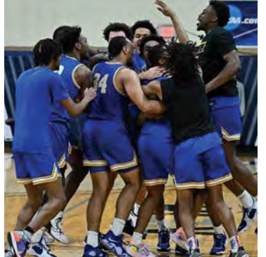
MBB at the Elite Eight SPORTS, page 8

The Chargers celebrate after the weekend, West Haven, March 26, 2023.