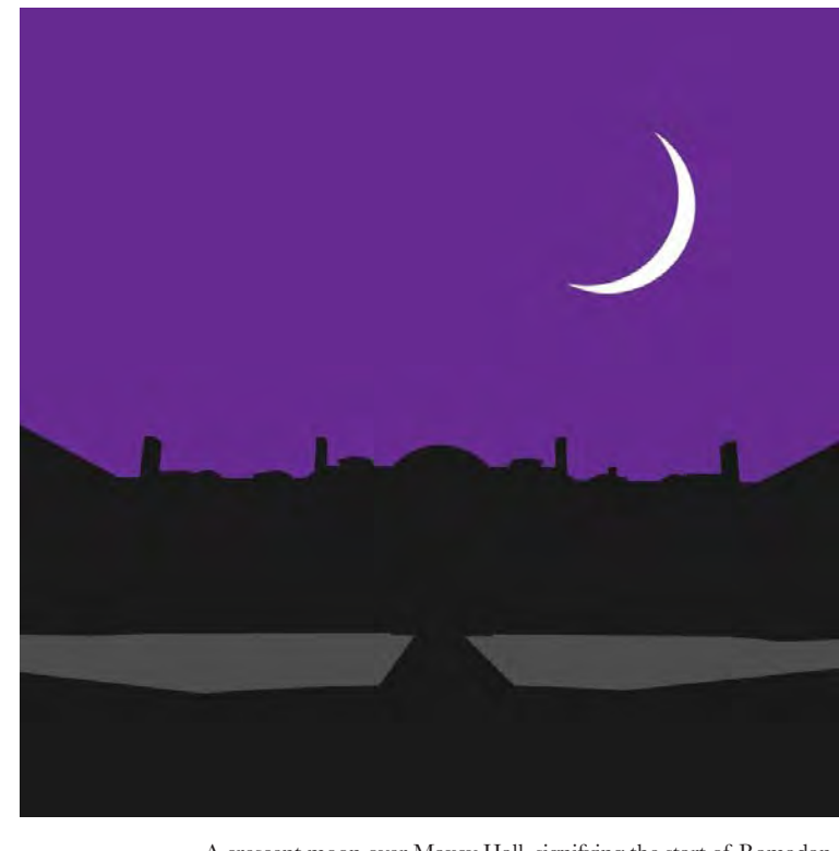
A crescent moon over Maxcy Hall, signifying the start of Ramadan