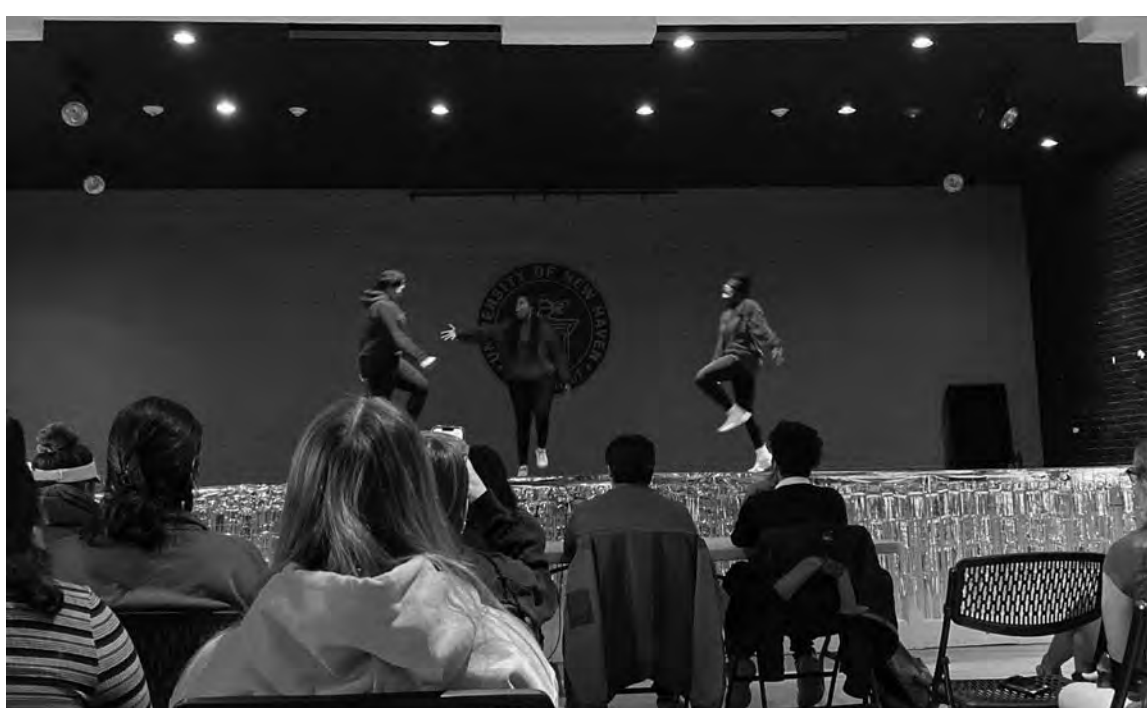
Monsoon Dance Crew onstage, West Haven, March 24, 2023.

Winners of the evening were revealed at the end of the event. In third place was the Monsoon Dance Crew; in second place was the Incendio Dance Project; and in first place was Illuminate. While there were only three winners, all the teams established so much time and effort into creating phenomenal routines that were executed fantastically.