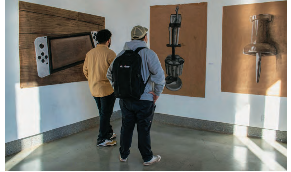
Students observing the art in the gallery, West Haven, March 9, 2023.

If you are interested in seeing the "Something So Little Can be so Big for Us" gallery, head over to the Seton Gallery by April 9.