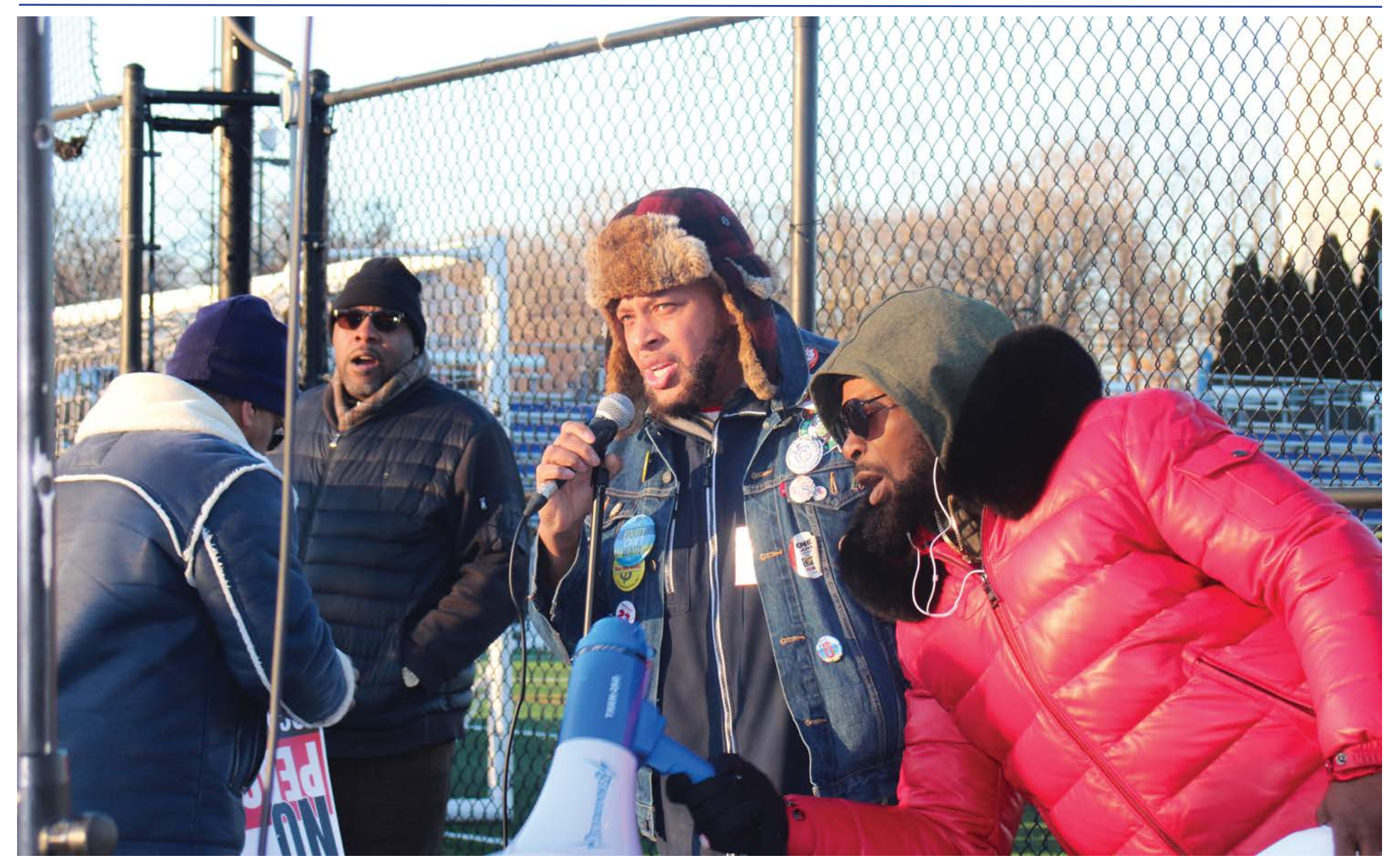
Employees speak out at the rally, West Haven, Feb. 19, 2024.