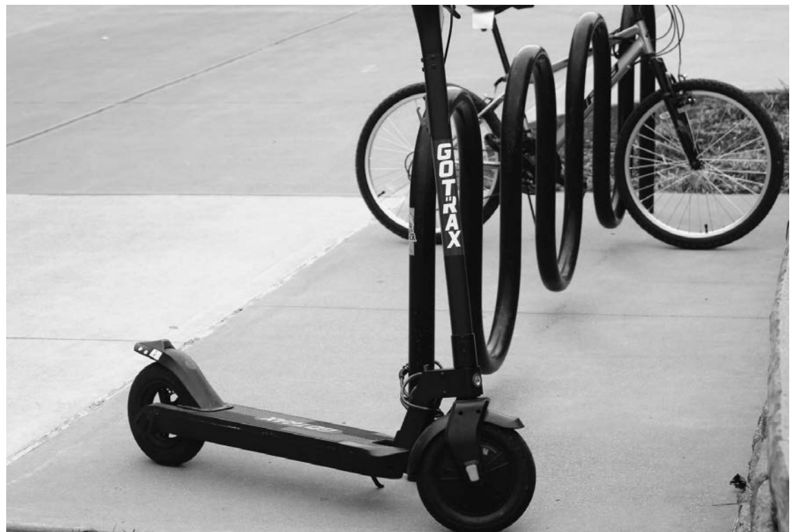
Electric scooter on campus by Peterson Library, West Haven, Jan. 30, 2024.

Reaction to the ban is an ongoing discussion in cities nationwide. In heavily populated cities such as New Orleans and Las Vegas, strict laws and restrictions have already been placed on e-scooters, such as placing a cap on speed limits of scooters, banning any scooter exceeding 20 mph.