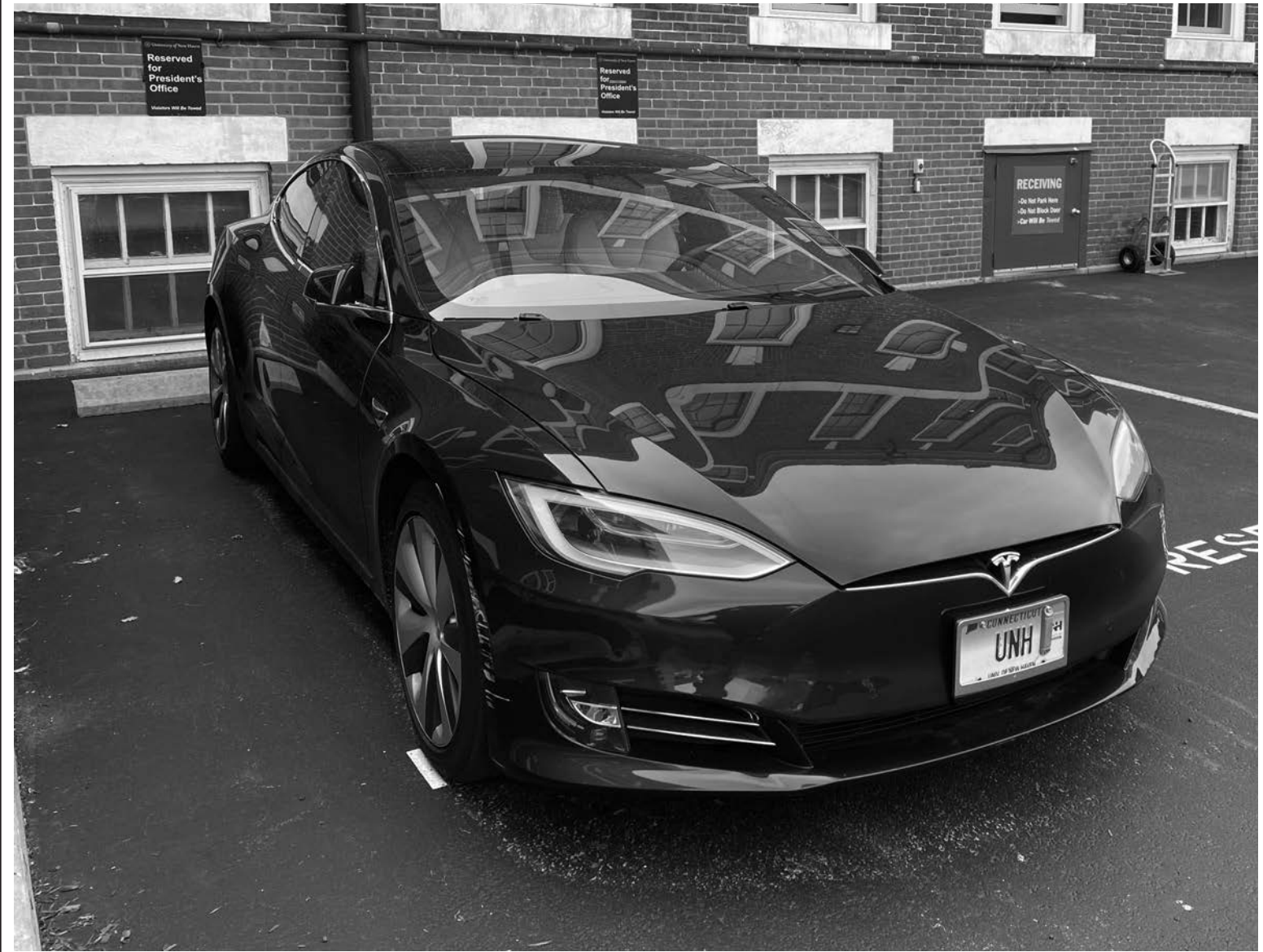
Former Chancellor Kaplan's Tesla, West Haven, April 28, 2023.

Would it really be that difficult to give students a sticker with nothing but a barcode on it?